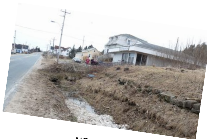
NOW WE CAN SEE!