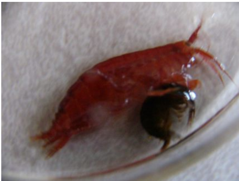
A clingy couple - This larger dark red female amphipod is paired together with her smaller brownish male partner until they are ready to mate.

mate from February to October depending on water temperature. Females and males pair up when mating and stay together until the female loses her outer shell (called molting) and the eggs can be fertilized by the male. During the pre-mating time the happy couple cling to each other with the smaller male carrying the much larger female on its back. In this day of liberation I would hazard to say that it looks more like the stronger female is holding and doing most of the swimming while protecting the small male. The female shell hardens for protection and then after a couple of weeks the fertilized eggs hatch inside her abdomen in a brood pouch. A week later, she molts a second time and releases the young.