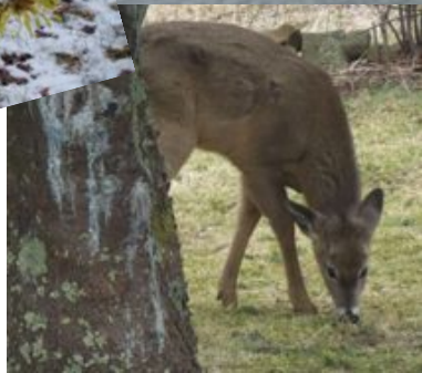
Dancing witch Hazel blossoms, Pheasant on snow, Skunk cabbage poking through, Deer searching for lunch