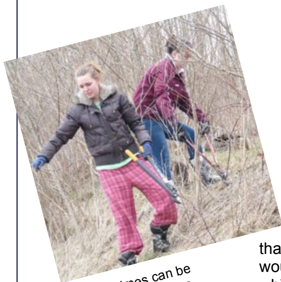
The job sometimes can be quite prickly when you are fighting blackberry and rosebushes.

During March Break some members of the Digby Neck / Islands GOMI Team got together at the Freeport Development Centre to clear some briars and tree growth that were blocking the view of would be visitors to the parking lot which serves those wishing to travel the Fundy View Trail, enjoy the Loyalist Park, or research their roots in the Islands Archives.