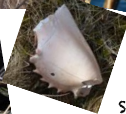
Sturgeon on marsh, Seagull in tree, Mink(?) out to dry, Abandoned Lobster shell, Bleached carcass on rocks