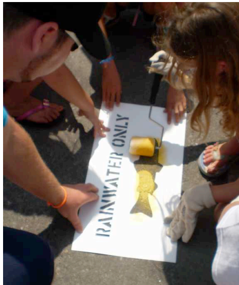
Yellow Fish Road – Trout Unlimited Program

Many municipalities in Canada and the United States now spray paint 'No Dumping, Drains to Ocean' messages on storm drains. This is an effective visual reminder that all pollutants entering the storm drains eventually end up in the ocean. Elementary schools in Yarmouth, Nova Scotia, have partnered with Trout Unlimited Canada's Yellow Fish Road program and have begun painting yellow fish with the message 'Rainwater Only' on storm drains around the community. By partnering with local NGOs and schools, municipalities can build successful outreach campaigns to encourage stewardship and protection of waterways. A great video on the Yellow Fish Road project in Yarmouth can be found here: http://www.youtube.com/watch?feature=player_embedded&v=x8vrdPR9D8k .