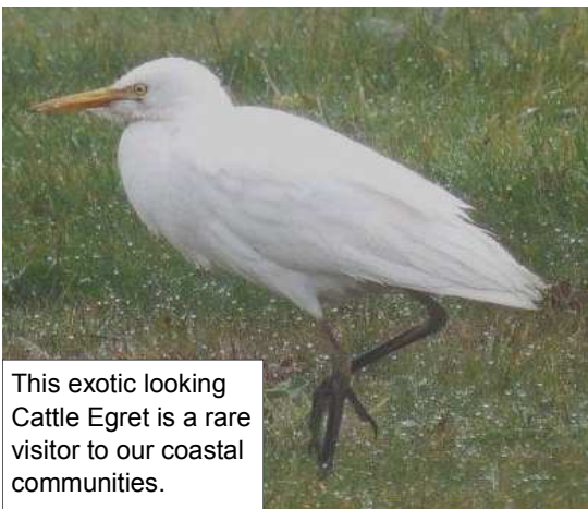
This exotic looking Cattle Egret is a rare visitor to our coastal communities.

This majestic animal is covered with white plumage and decorated with a yellow beak and greenish-