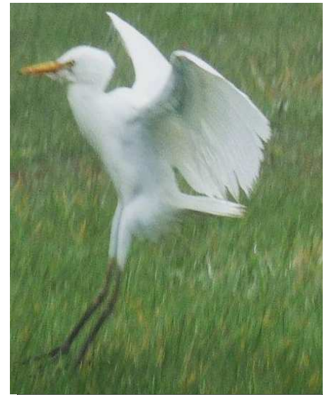
This graceful flier has a wingspan of nearly a metre.

yellow feet. During breeding season they develop buffy orange plumes on the back, breast and crown. They are more commonly viewed in fields than along water as they feed on a wide variety of foods including: grasshoppers, spiders, crickets, flies, moths, frogs, and earthworms. In the event insects are not available they have been known to eat small birds and ripe dates. Their name is an accurate one because they prefer to be around wild animals or livestock where the animals grazing stir up lots of insects. By doing so it has been estimated that they can gather 50% more food while using only two thirds of the energy. In addition the birds have such amazing vision and hearing that they can act as an early warning system of approaching predators. To sweeten the deal these egrets give added relief to their neighbours by eating vast number of flies and other insects that often plague grazing animals. In fact egrets have been introduced to some locations like Hawaii to help protect cattle. They will follow tractors and other farm equipment around for newly exposed insects. They also like to stake out fields around airports as airplanes disturb the grass and rile up insects. Another novel fact about their feeding habits is they will often fly great distances toward the smoke from fires so that