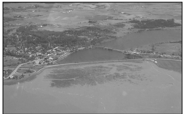
Accumulated sediment immediately seaward of the causeway.

However, the most dramatic and clearly perceptible impact of the causeway has undoubtedly been just downstream, where there has been a steady build up of massive quantities of fine sediment on a pre-existing intertidal mud bar. As soon as the causeway was completed, sediment began accumulating by as much as 15 cm (6 inches) a month during the summer. For two decades the expanding mudflats remained soupy, unstable and mostly barren of visible life. However, by the early 1990's the accumulating mud had consolidated and stabilized sufficiently to support growing populations of burrowing invertebrates and the first pioneering shoots of the salt marsh grass Spartina alterniflora . These hardy, well-rooted plants securely anchored the mud and, by acting like swaths of miniature snow fencing, further hastened the deposition of swirling silt. It was originally anticipated that the mud would build right up against the downstream face of the causeway; instead, however, a broad channel persisted along the front of causeway because of the tidal flows. However, by the late 1990's this channel too had begun to close, so that the saltmarsh may eventually come to rest against the