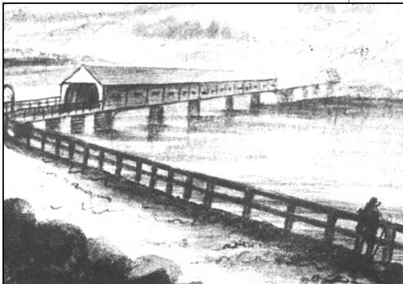
The first bridge across the Avon at Windsor

In the early 1950's, a delegation of government officials from the Maritimes returned from a European tour favourably impressed by Dutch efforts to control tidal flooding by constructing barrages across the mouths of major rivers.