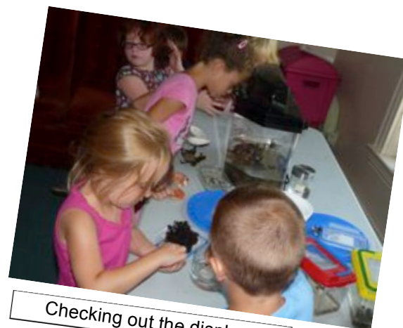
Checking out the displays

The aquarium allowed the participants to view barnacles feeding and anemones waving their tentacles in search of food. The Centre's young people had a chance to handle some of the creatures. Although everyone had a good time it was not the same as the full seashore experience we had the previous two summers. Hope to see you all again next year ON THE BEACH!