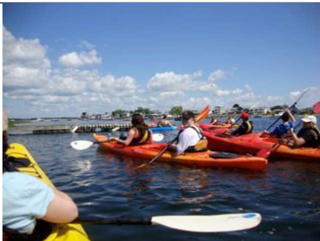
Kayaking was a new experience for most GOMI participants.