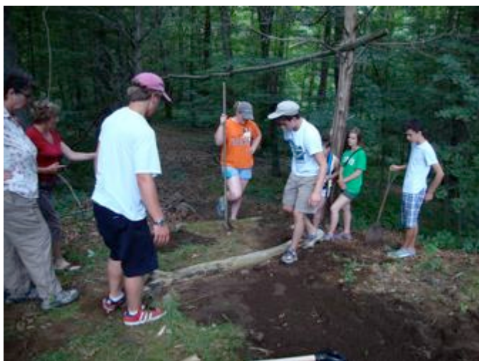
The Woodlands theme team cleared, repaired and labeled existing trails on the Adelynrood property.