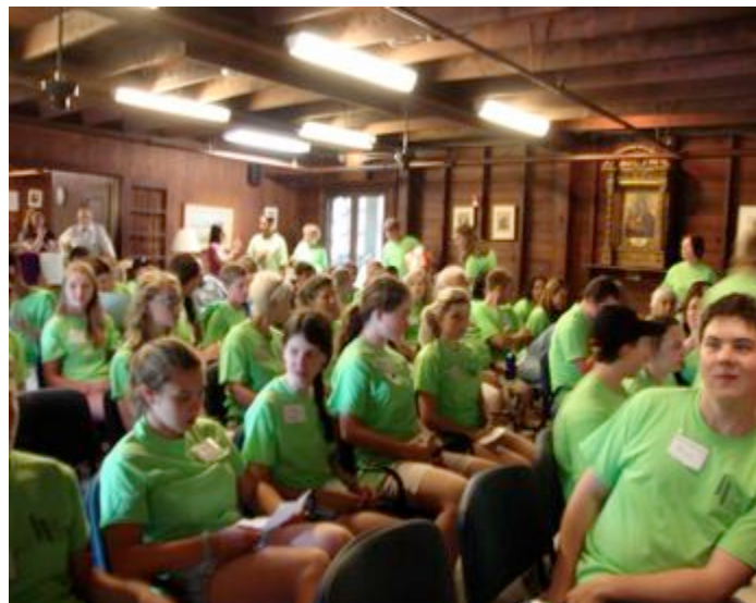
Last Day: Theme teams are prepared to present their week's work to a panel of guests including GOMI board members and scientists.