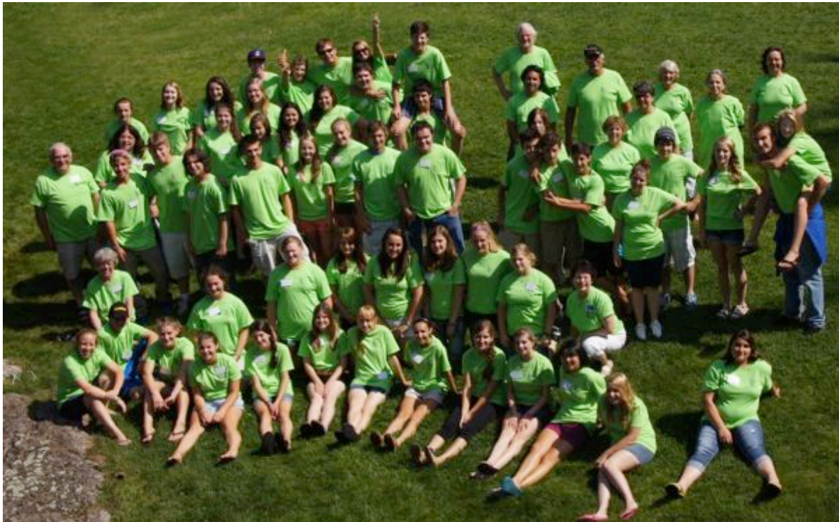
GOMI Summer 2012 participants say good-bye to Adelynrood

What makes this creature so amazing is that we know virtually little about its behaviour, physiology and life cycle in the wild and what its actual role in the environment is! As humans we often hear statements from companies and governments that chemicals released accidentally or by design have little impact on sea life. Given that we know so little about the pink sea cucumber and thousands of other little studied creatures those statements of comfort may be hollow. How can we be confident when in fact we know so little about the thousands of marine species that we are entrusted to protect?