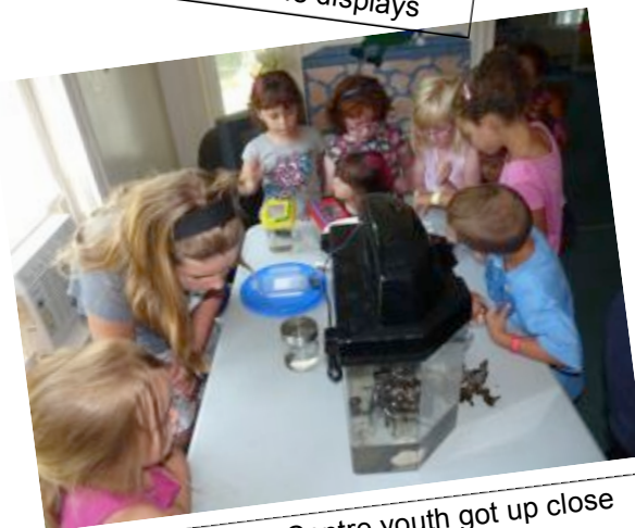
About 18 Resource Centre youth got up close and personal with marine life.