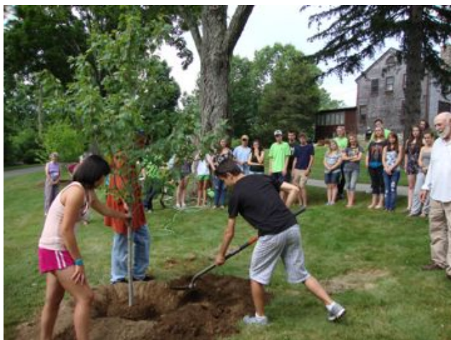
The GOMI Summer Institute members planted a tree during the closing ceremony at Adelynrood in Massachusetts.