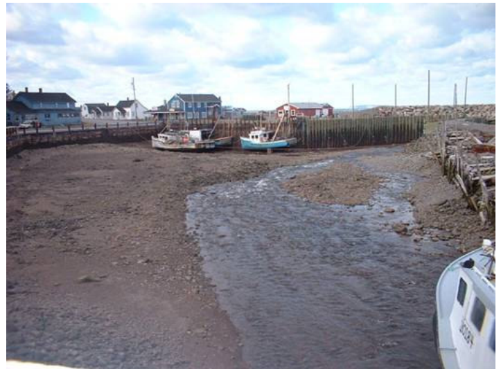
Figure 4. Downstream of crossing