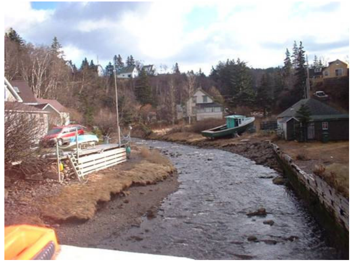
Figure 2. Upstream of crossing