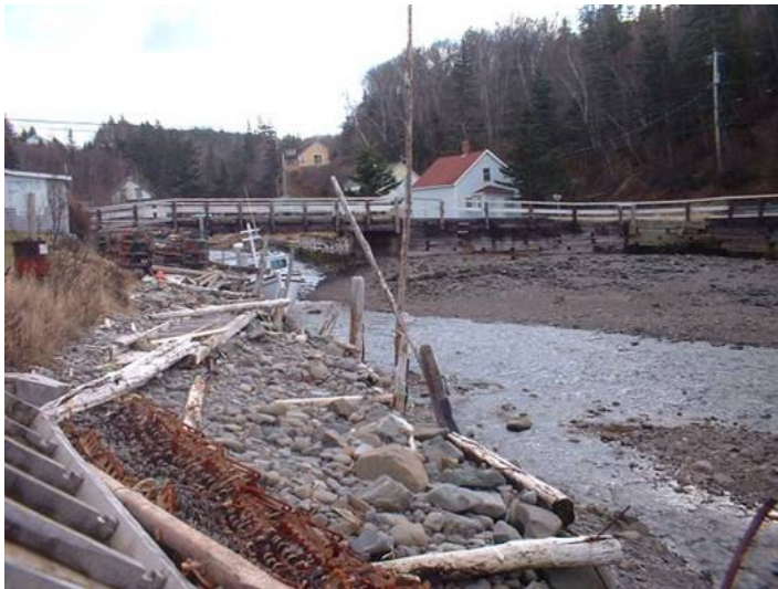
Figure 3. Downstream view of crossing