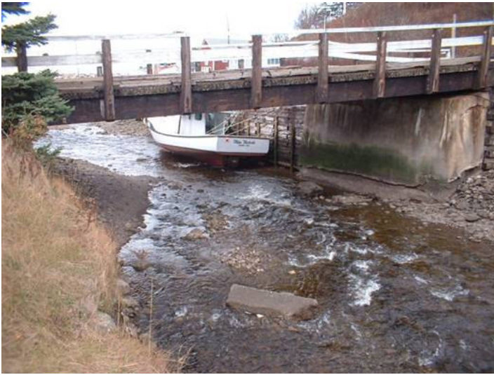
Figure 1. Upstream view of crossing