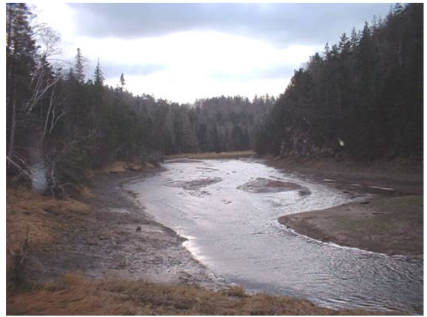
Figure 4. Upstream of crossing