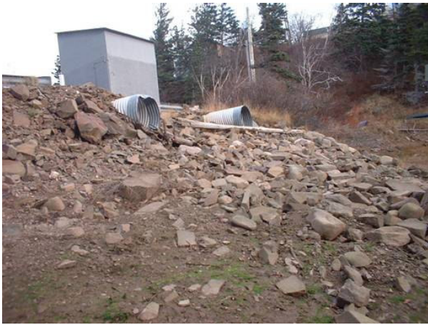
Figure 3. Upstream view of crossing