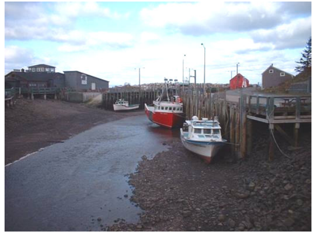
Figure 2. Downstream of crossing