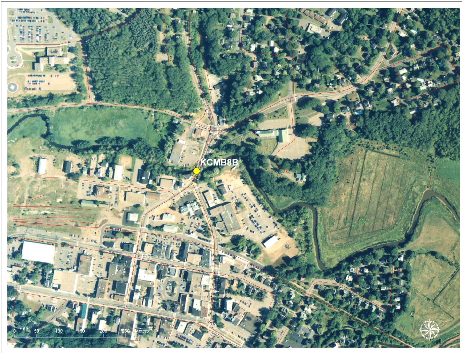
Figure 4: 2002 Aerial photograph containing tidal barrier data, (1: 10,000)