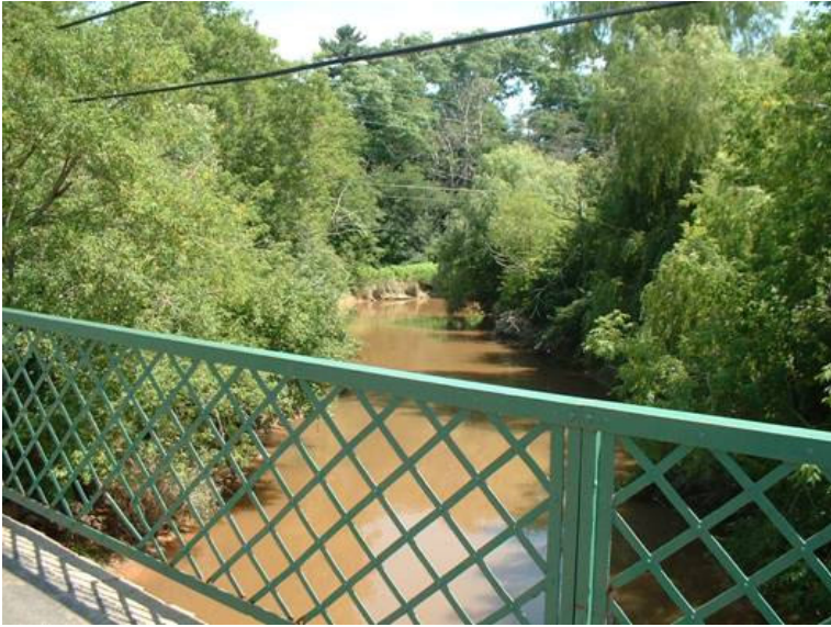
Figure 1. Downstream of crossing, forested.