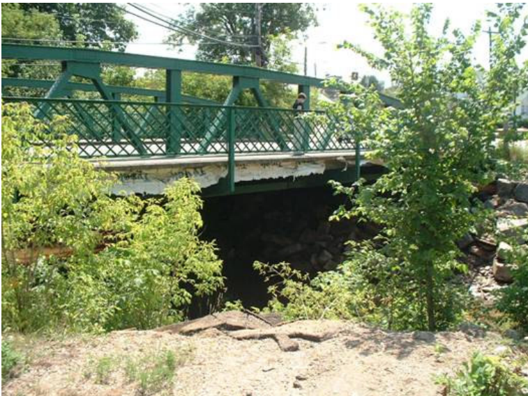
Figure 2. Crossing view from upstream