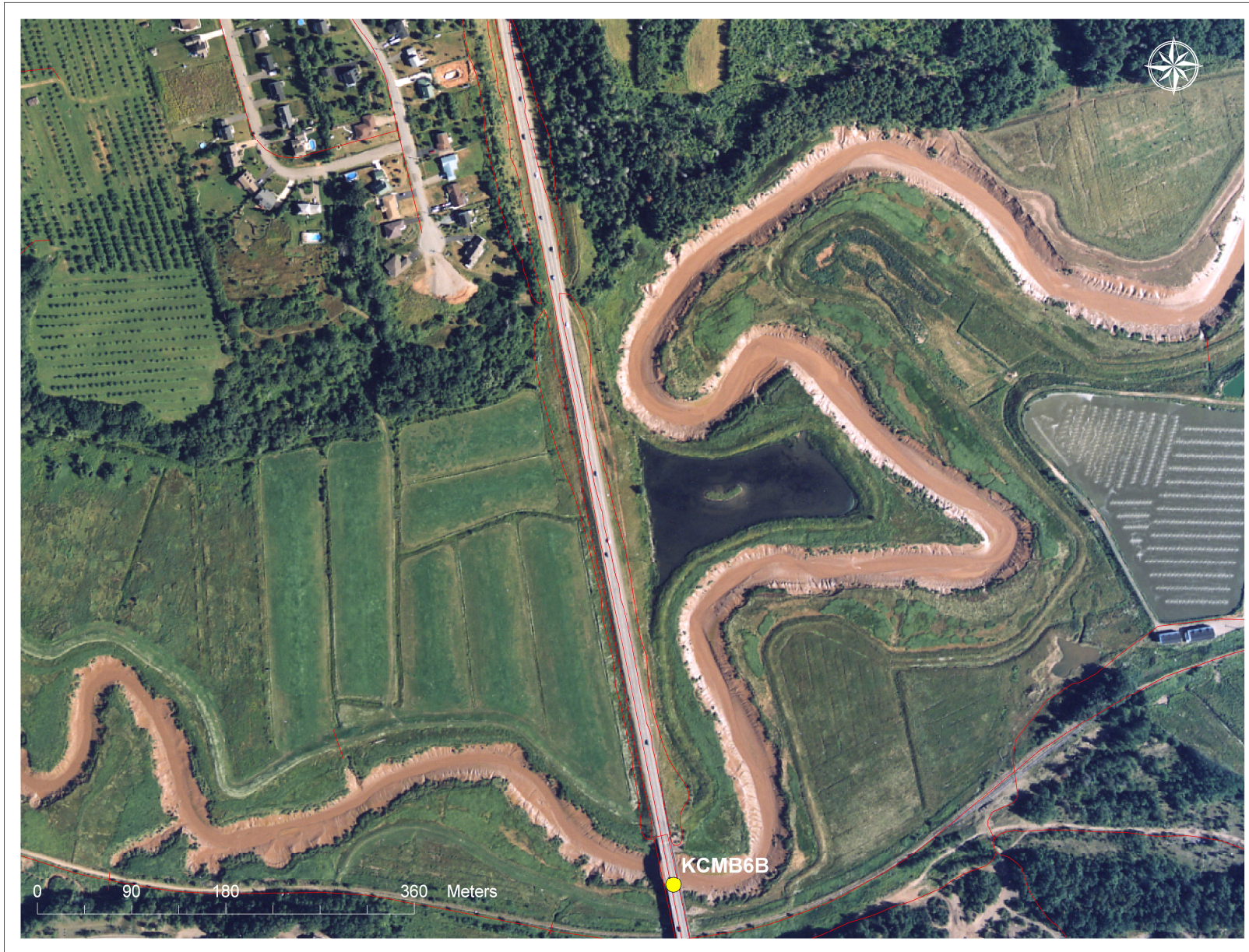
Figure 3: 2002 Aerial photograph containing tidal barrier data, (1: 10,000)