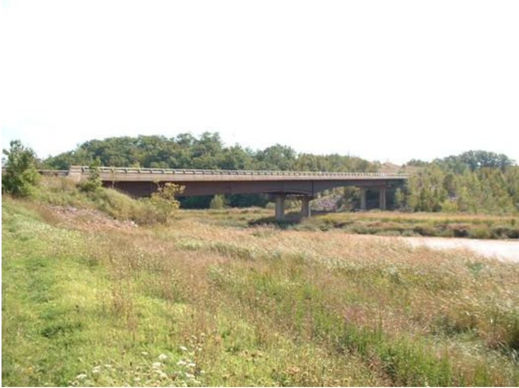
Figure 1. Upstream view of bridge