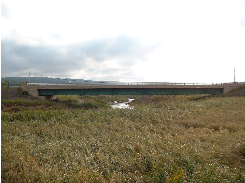
Figure 1. Full view of the bridge.