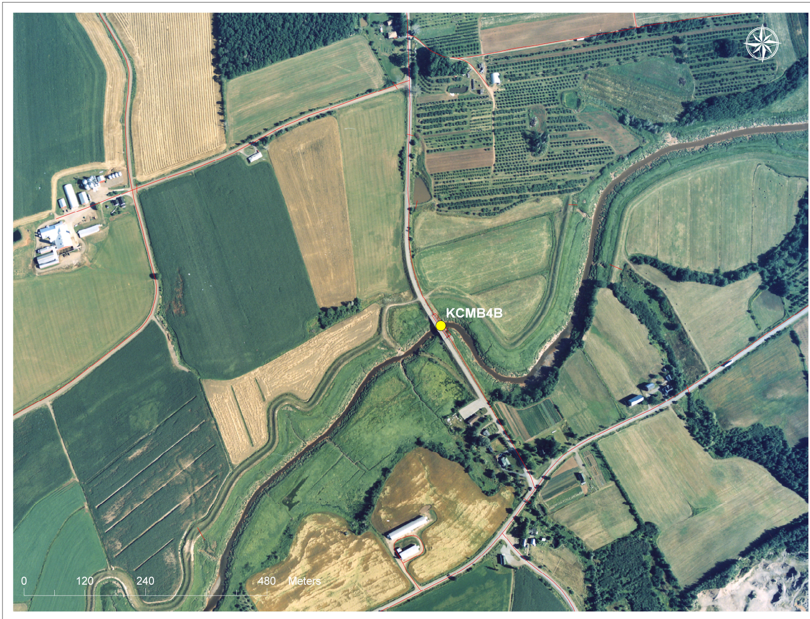
Figure 3: 2002 Aerial photograph containing tidal barrier data, (1: 10,000)