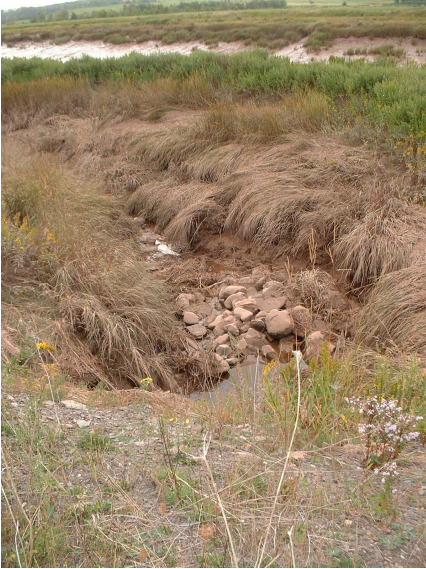
Figure 1. Downstream of creek.