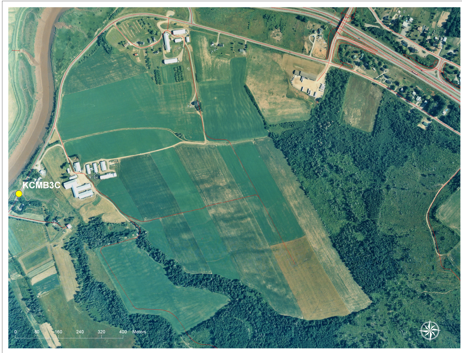
Figure 4: 2002 Aerial photograph containing tidal barrier data, (1: 10,000)