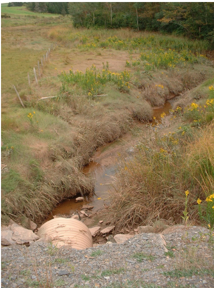
Figure 2. Upstream of creek.