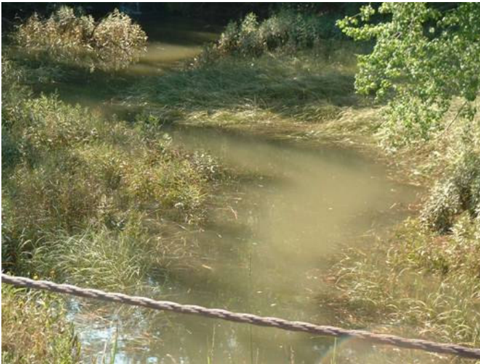
Figure 2. Upstream of crossing