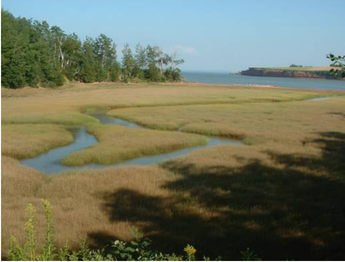
Figure 1. Downstream of crossing