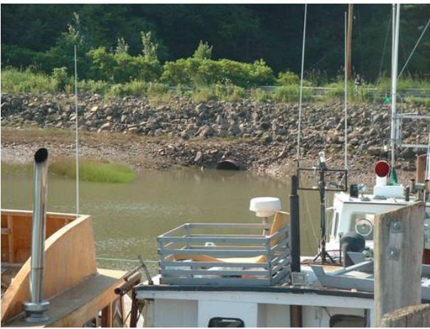
Figure 2. Upstream of culvert during high tide