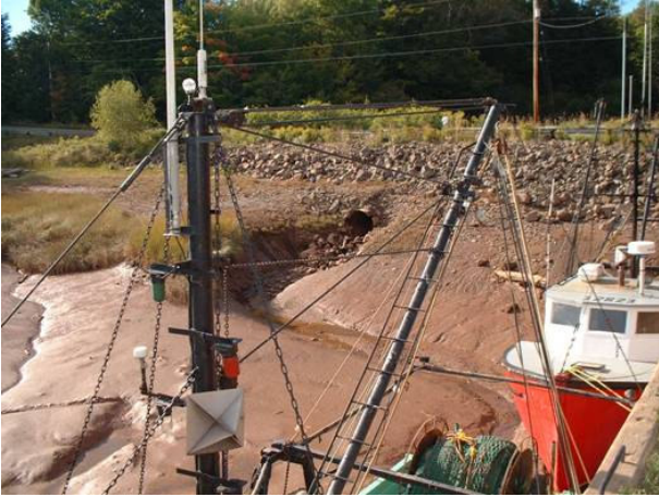
Figure 1. Downstream of crossing