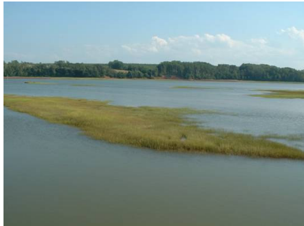
Figure 3 and 4. Downstream of crossing at mid tide