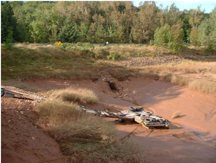
Figure 2. Downstream at low tide