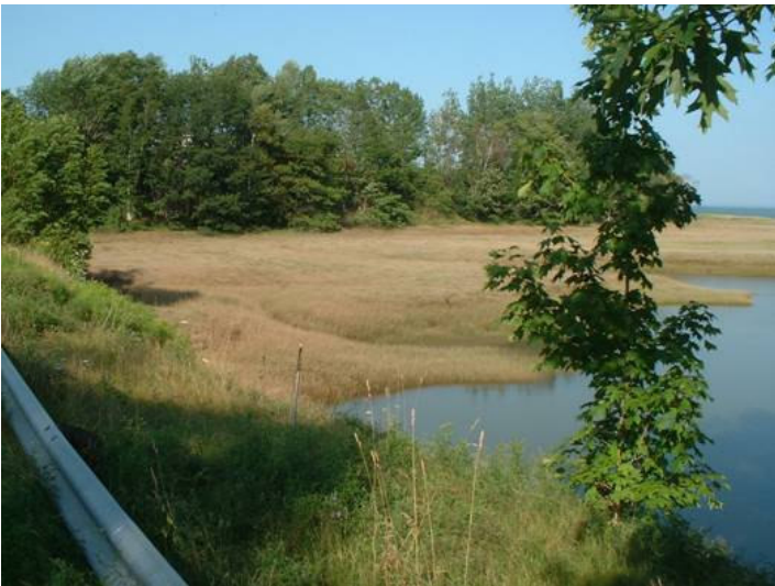
Figure 1. Downstream of crossing