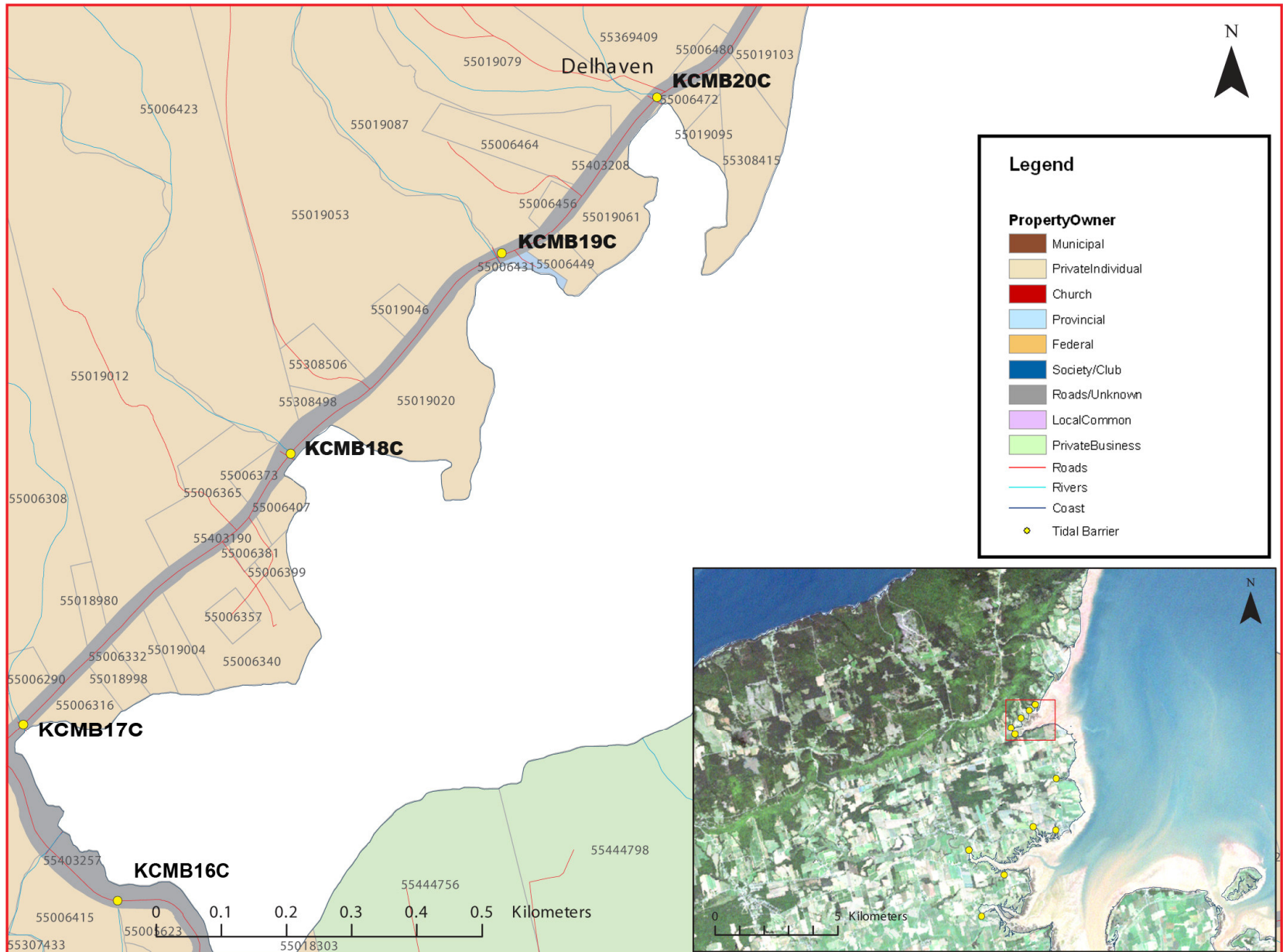
Figure 4: Property management and tidal barrier data for Nova Scotia (Service Nova Scotia, and Municipal Relations)