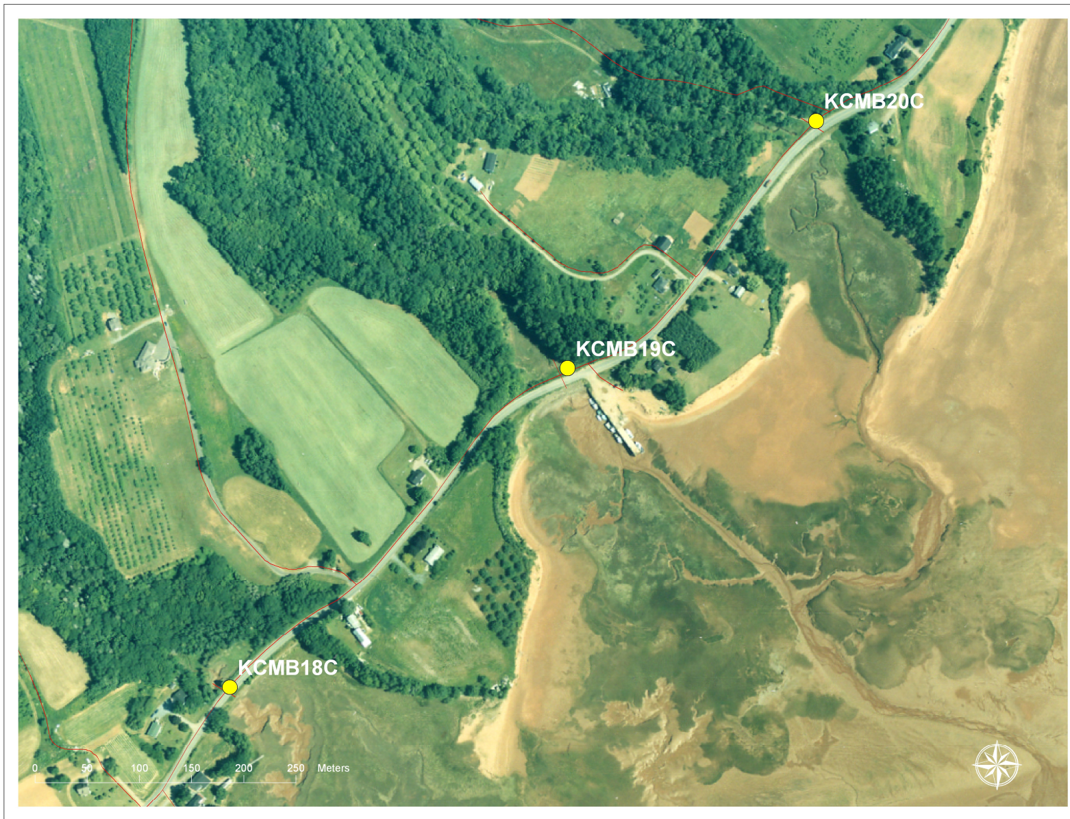
Figure 5: 2002 Aerial photograph containing tidal barrier data, (1: 10,000)