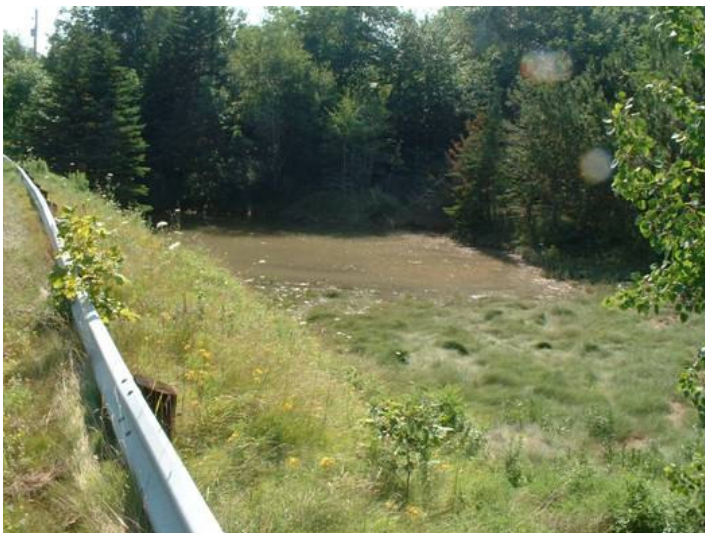
Figure 3. Upstream of crossing