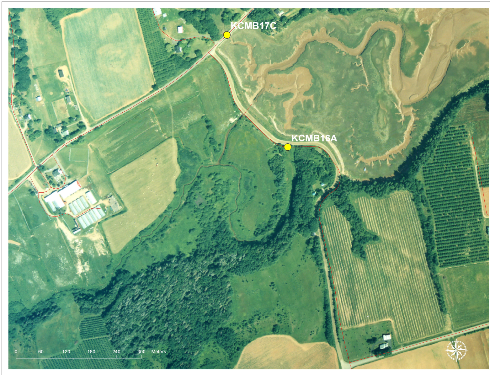
Figure 5: 2002 Aerial photograph containing tidal barrier data, (1: 10,000)