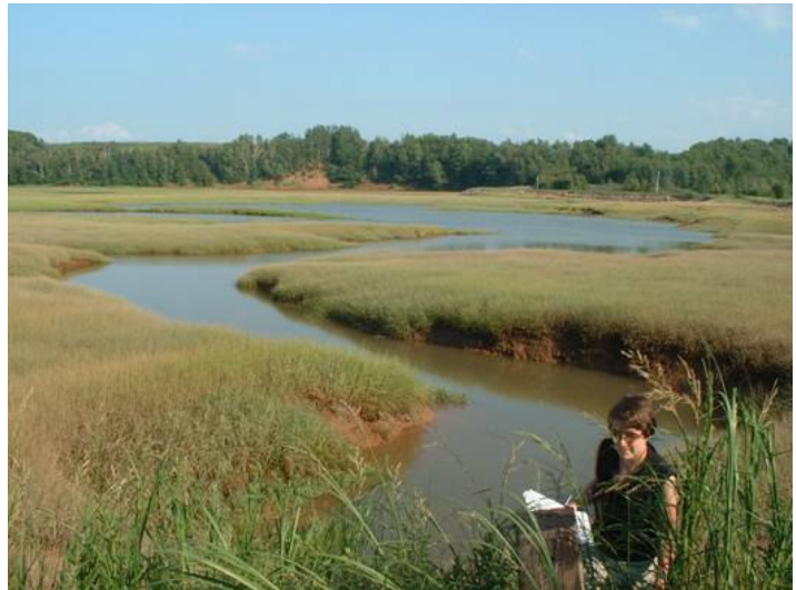
Figure 2. Downstream of crossing at low tide