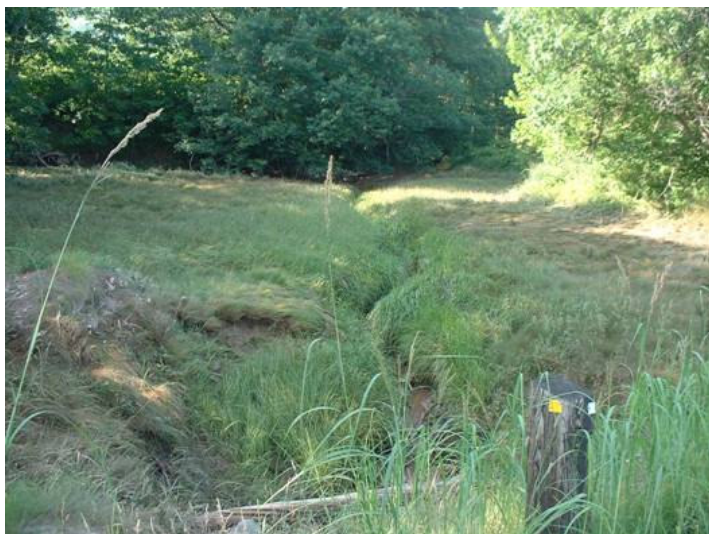
Figure 3. Up stream of crossing at low tide