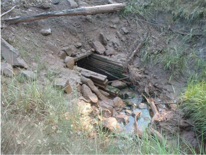
Figure 1. Culvert upstream