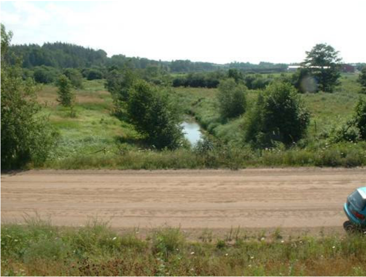
Figure 1. Upstream of dyke