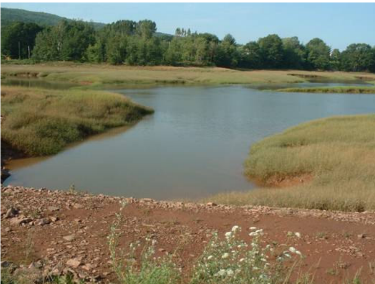
Figure 2. Downstream of dyke