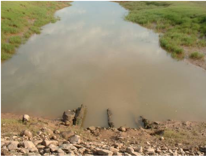
Figure 1. Downstream of crossing at mid tide