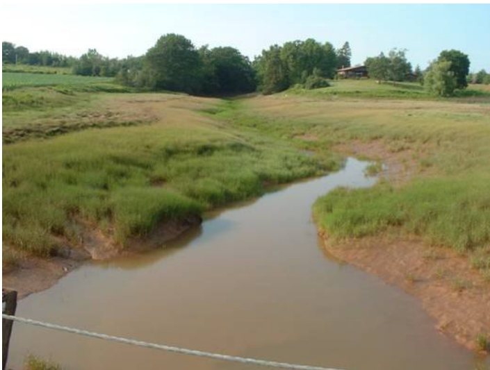
Figure 3. Upstream view from crossing