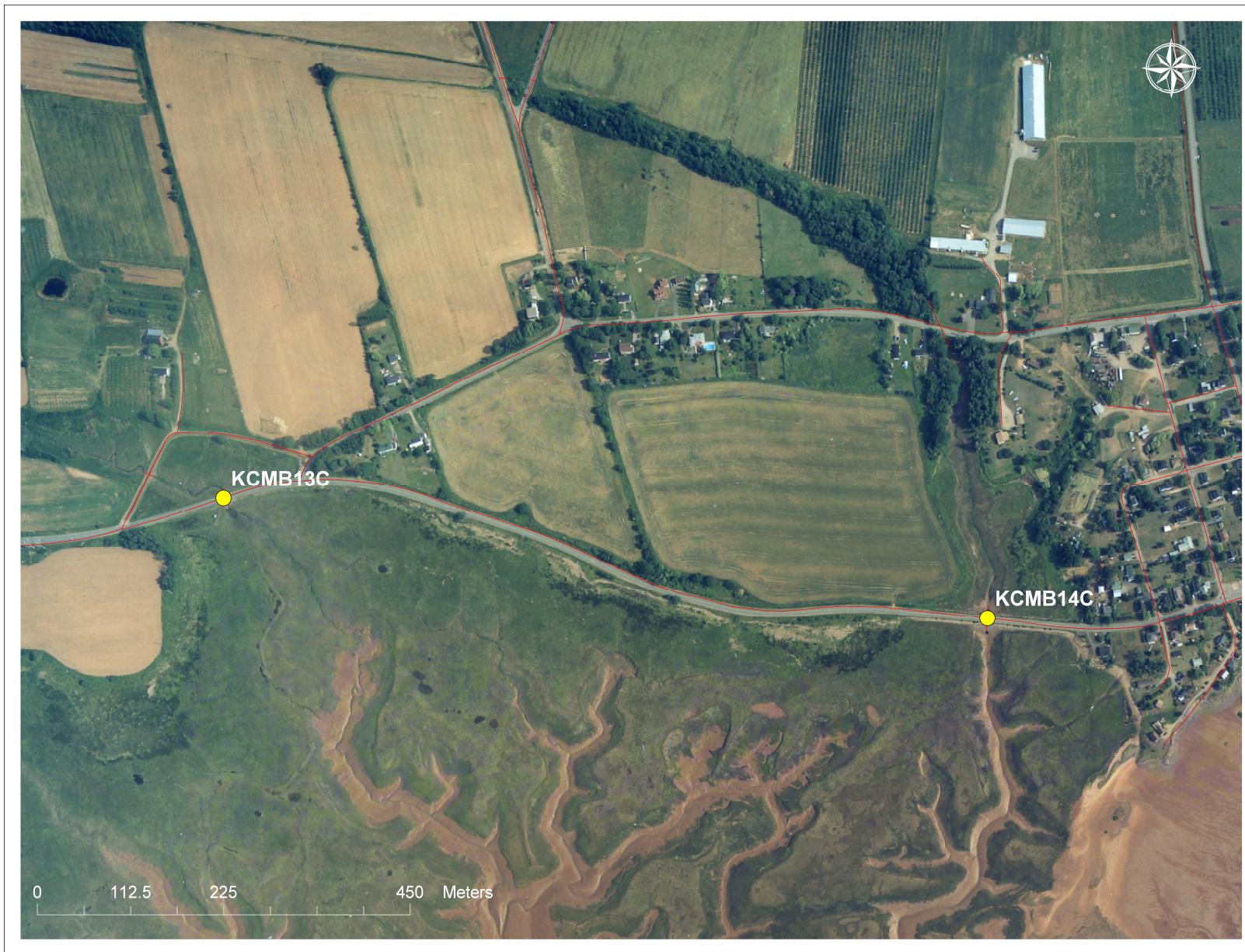
Figure 5: 2002 Aerial photograph containing tidal barrier data, (1: 10,000)