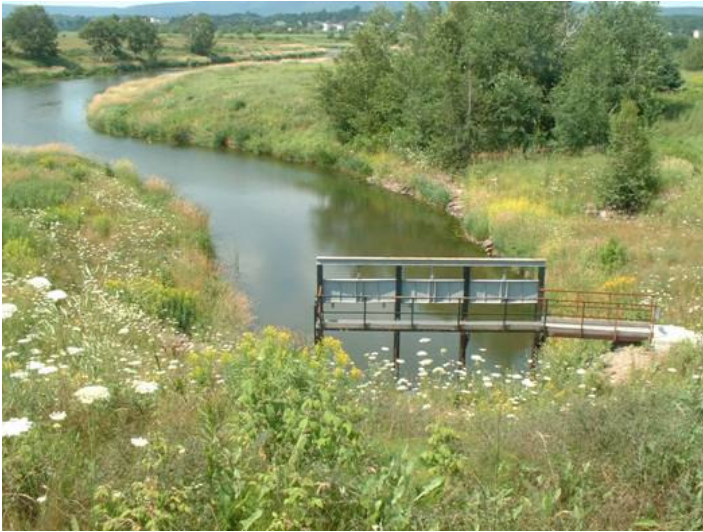
Figure 2. Upstream end of aboiteaux and upland area.