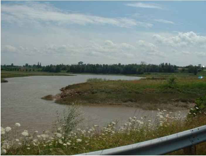
Figure 1. Downstream of aboiteau, large salt marsh