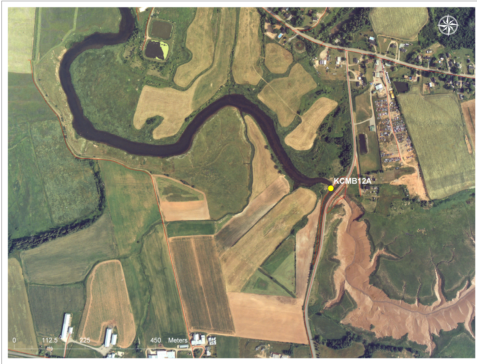
Figure 4: 2002 Aerial photograph containing tidal barrier data, (1: 10,000)