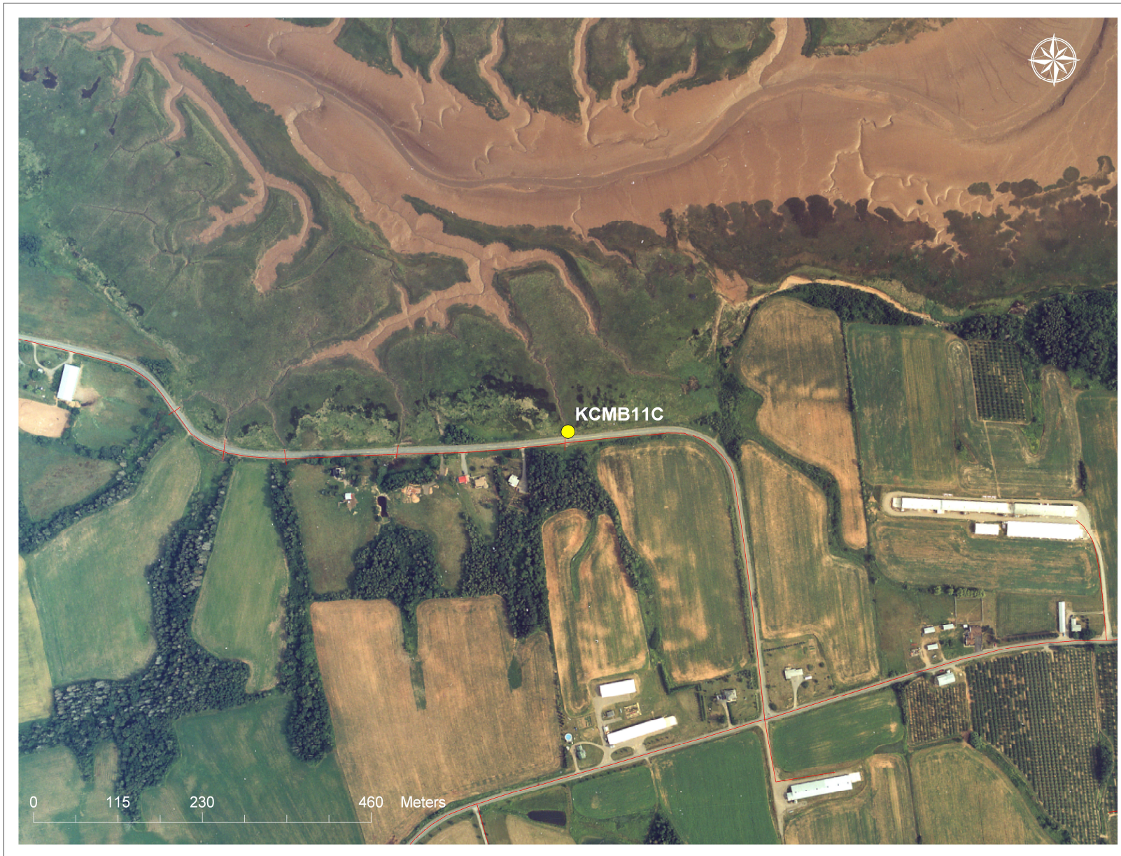
Figure 3: 2002 Aerial photograph containing tidal barrier data, (1: 10,000)