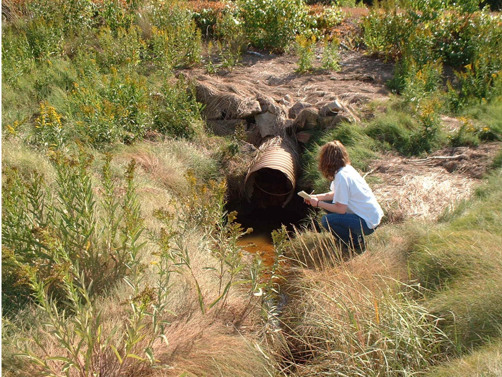
Figure 1. Downstream view of the culvert with rotting bottom.