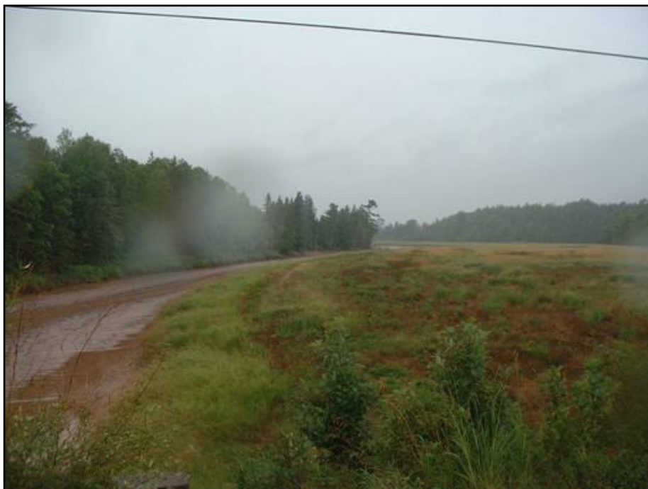
Figure 3: upstream