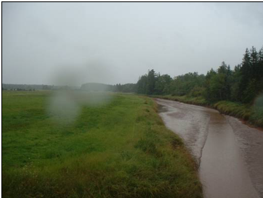
Figure 2: upstream