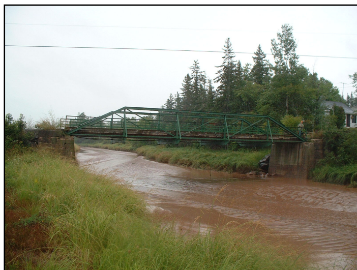
Figure 1: Downstream of the bridge shows the elevation rise on one side of the river with trees and a house. The other side of the river is where the animals graze.