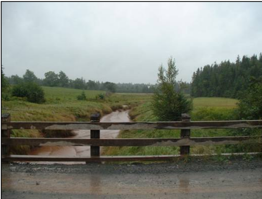
Figure 3: Downstream of the bridge shows steep creek banks and tree growth. Salt vegetation is evident very near the creek.