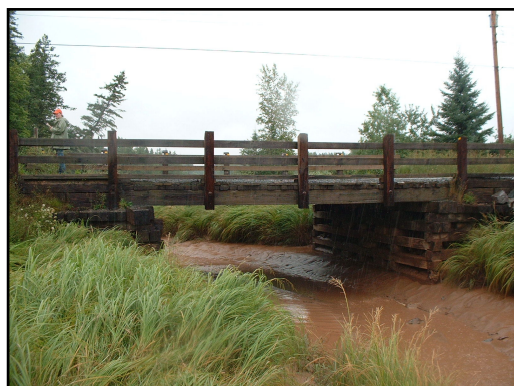
Figure 1: Downstream of bridge. Wooden support structures are on the upper banks of the creek.