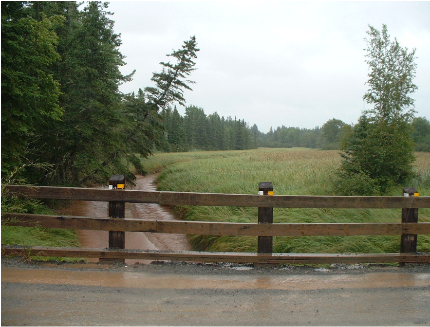
Figure 2: Upstream of the bridge there is tidal mud in the creek and trees growing quite close to it.