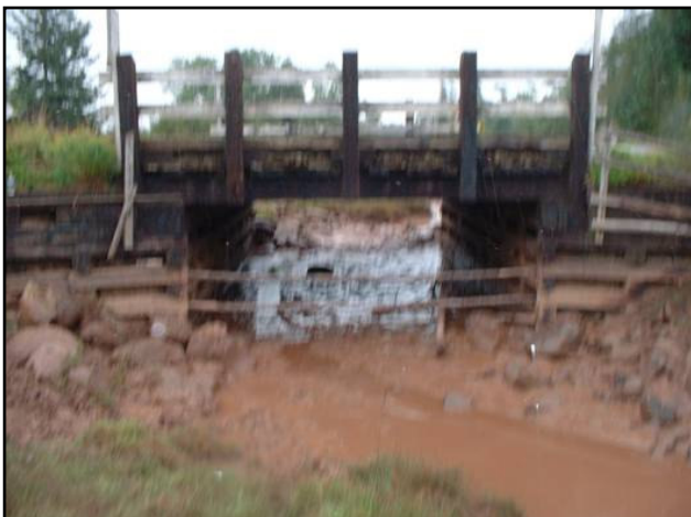
Figure 1: A fence built across the creek under the bridge keeps grazing animals from going to the other side, but the banks of the creek are not protected.

Comments: When repair or replacement is needed, the structure should remain a bridge with an opening width no smaller than 5m.