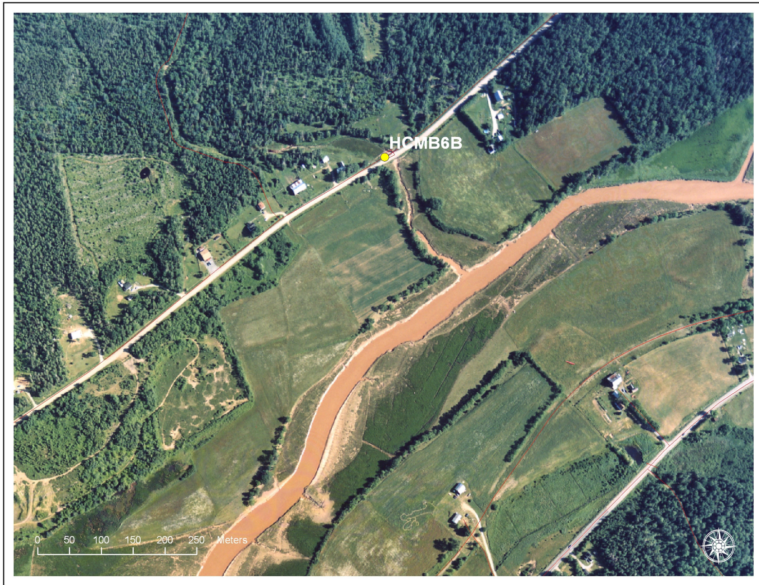
Figure 3: 2002 Aerial photograph containing tidal barrier data, (1: 10,000)