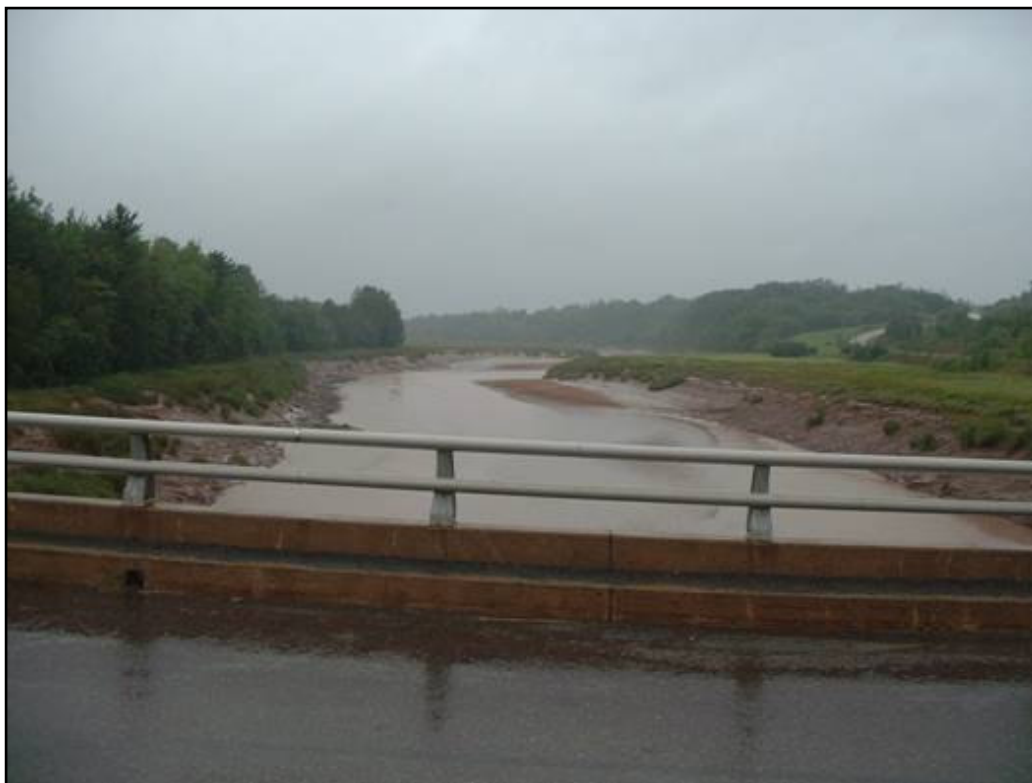
Figure 2: Upstream