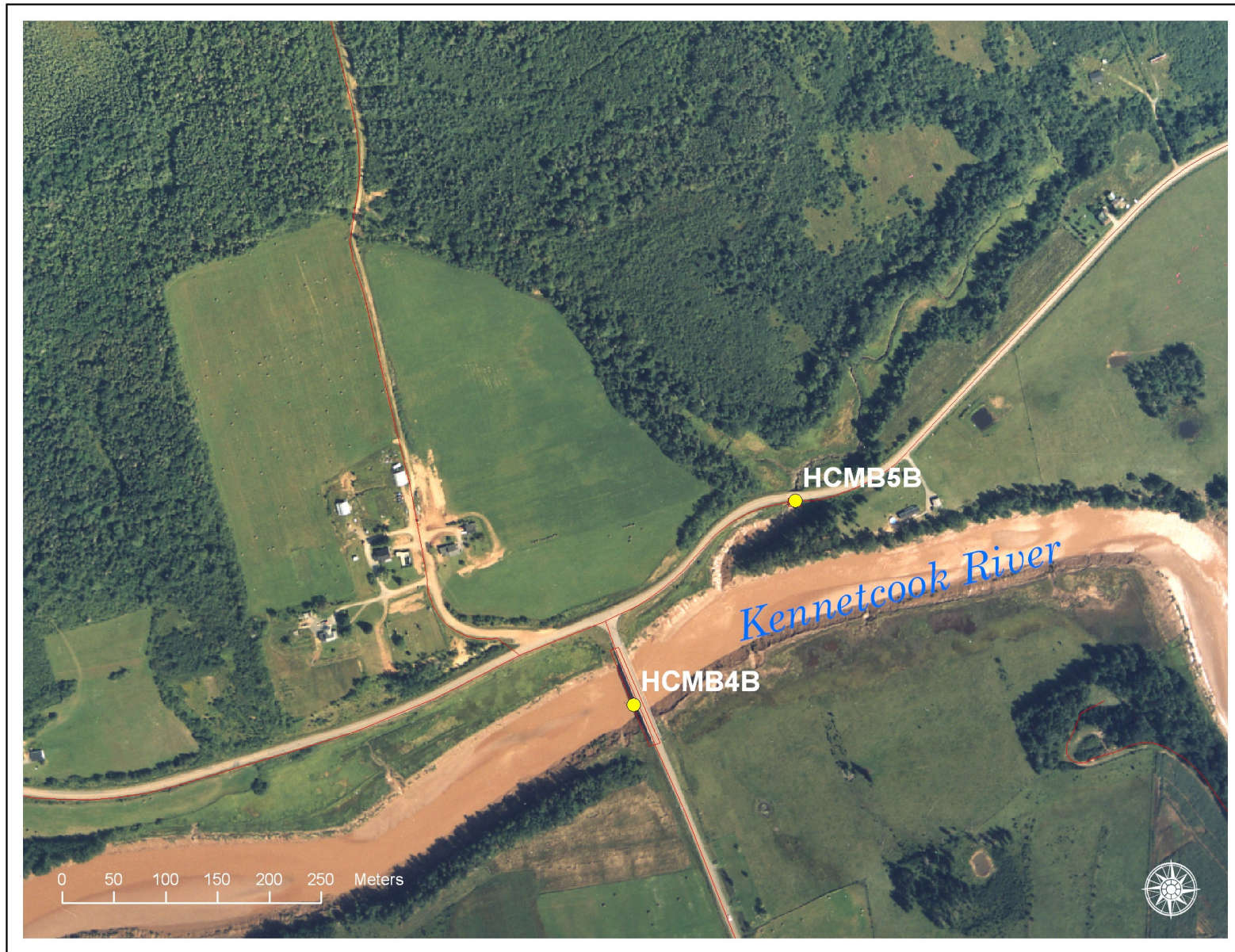
Figure 5: 2002 Aerial photograph containing tidal barrier data, (1: 10,000)