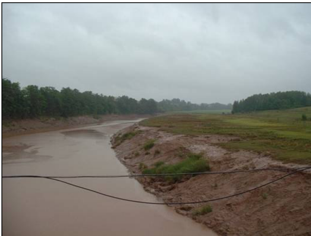
Figure 3: downstream