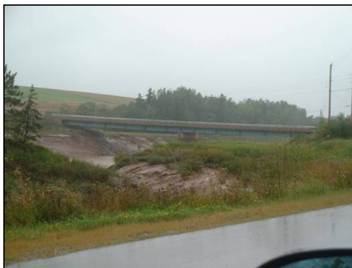
Figure 1: Upstream view of the bridge.