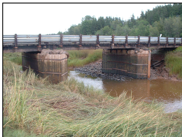
Figure 1: The large support structures narrow the opening under the bridge, but still allow adequate tidal flow.