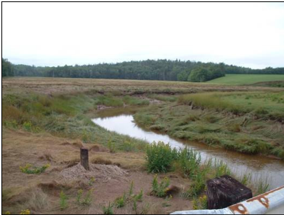
Figure 2: downstream