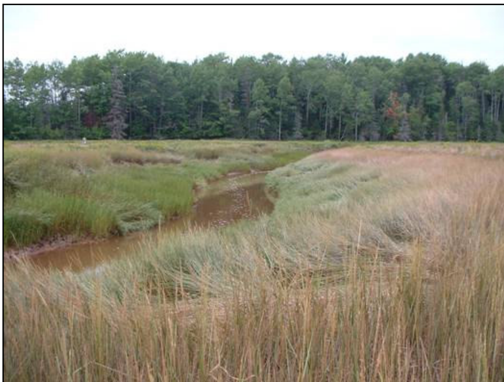
Figure 3: upstream