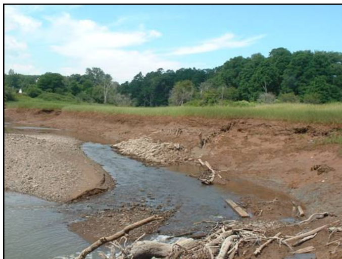
Figure 5: replacement or removal of broken gate would reduce the accumulation of debris