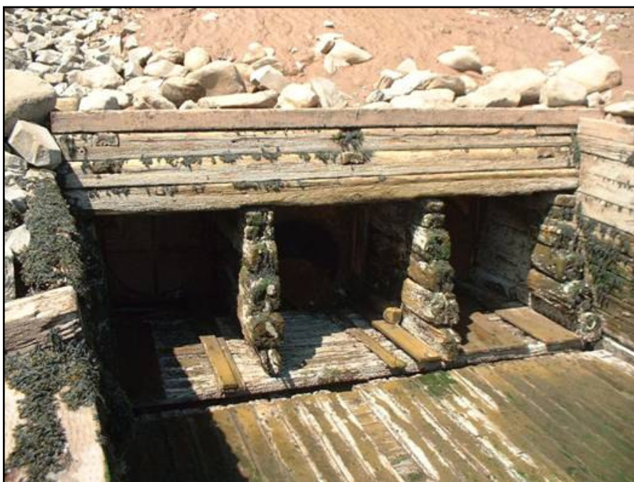
Figure 7: close up view of culvert