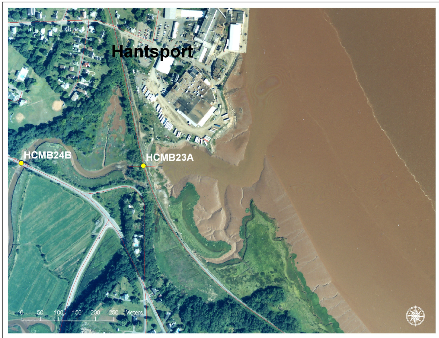
Figure 9: 2002 Aerial photograph containing tidal barrier data, (1: 10,000)