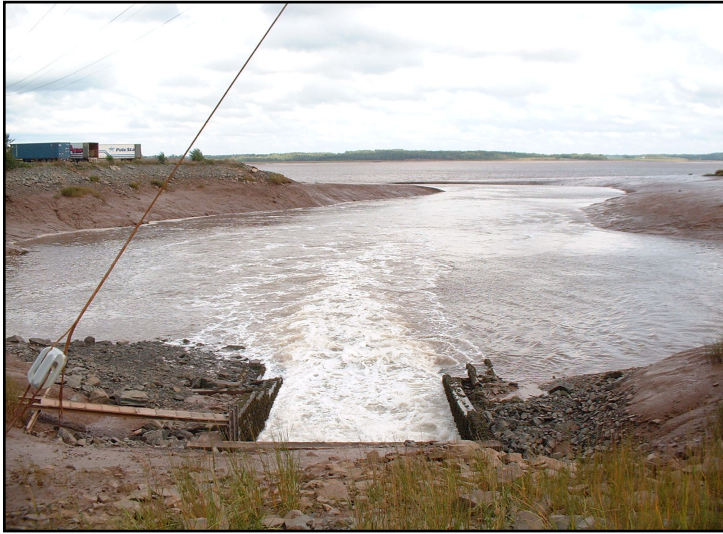
Figure 1: The extremely turbulent outflow through the comparatively small culvert.