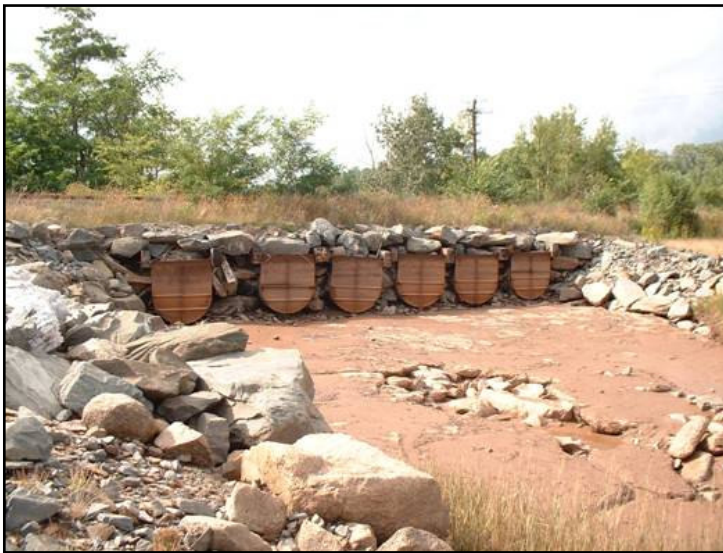
Figure 3: Downstream of the six overflow aboiteaux.