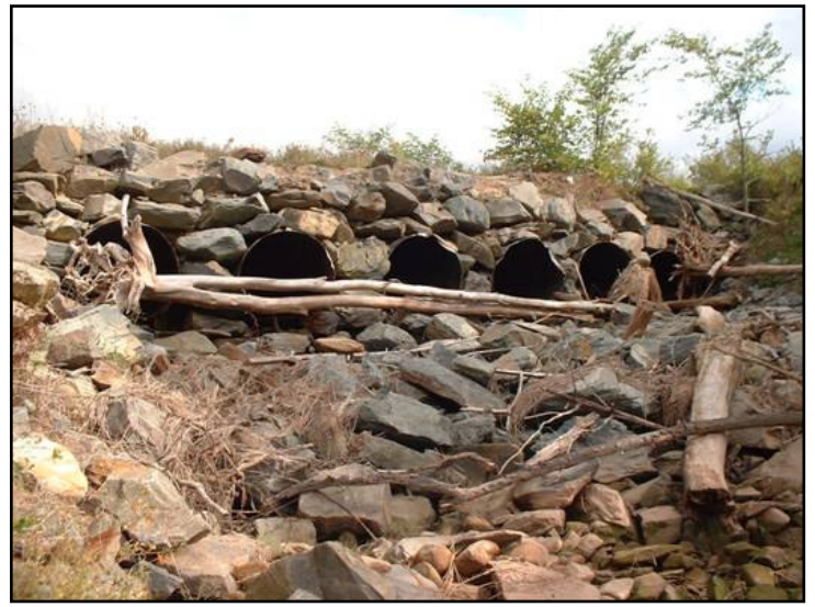
Figure 4: Upstream of the six overflow aboiteaux.