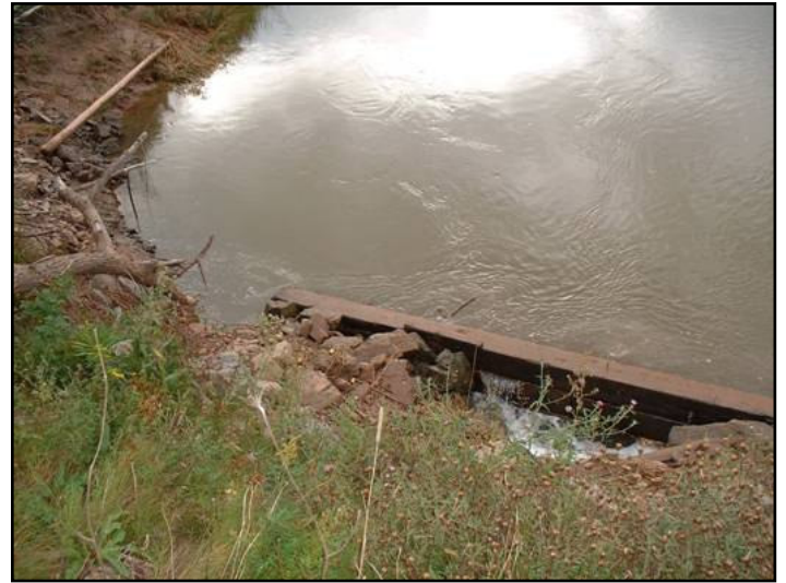
Figure 2: Swirling and small eddies as the water is trying to drain through the upstream side of the culvert.