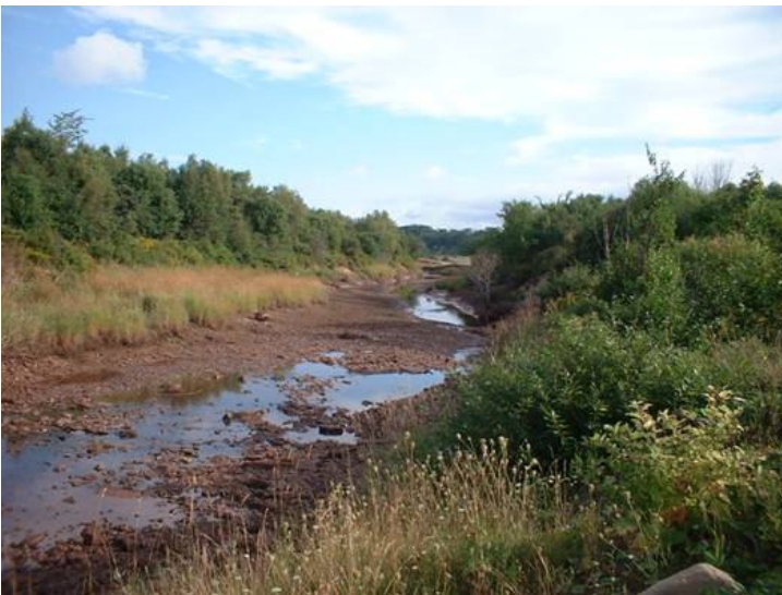
Figure 2. Downstream of bridge.