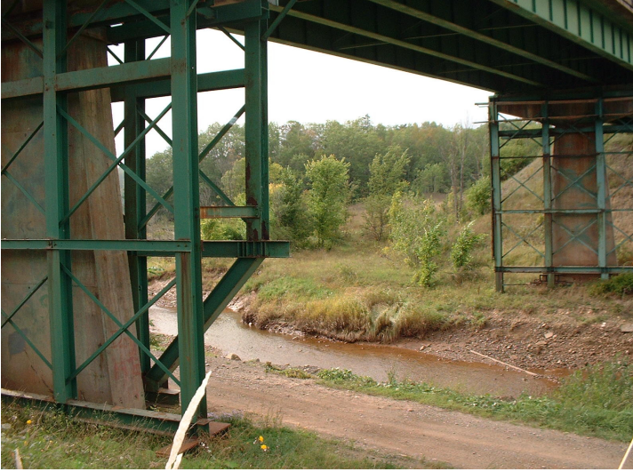
Figure 1. Photo taken from the road under the bridge.