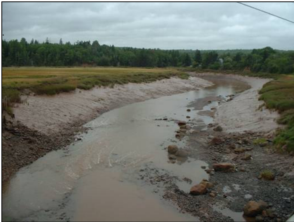
Figure 2: Downstream