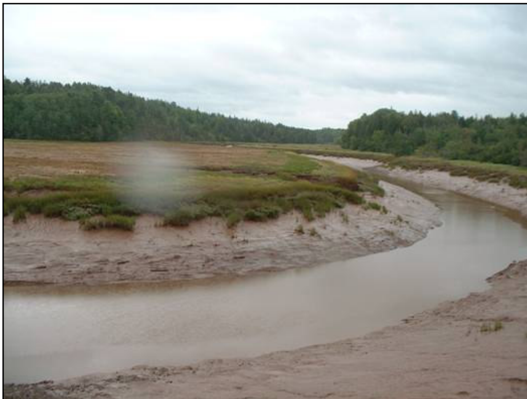
Figure 3: Upstream