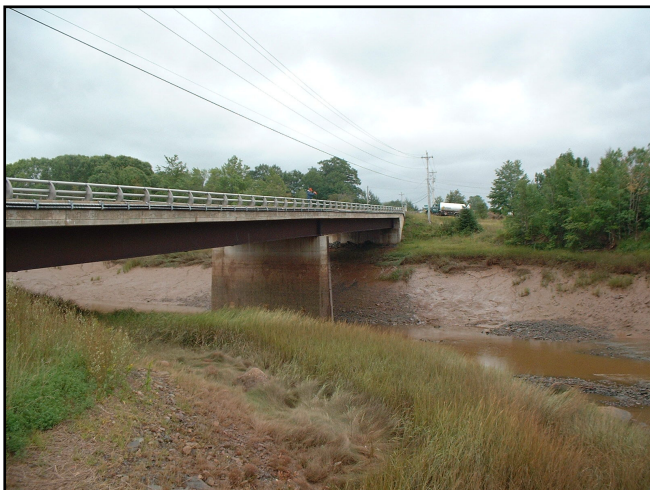
Figure 1: Downstream view of the bridge from the dyke.