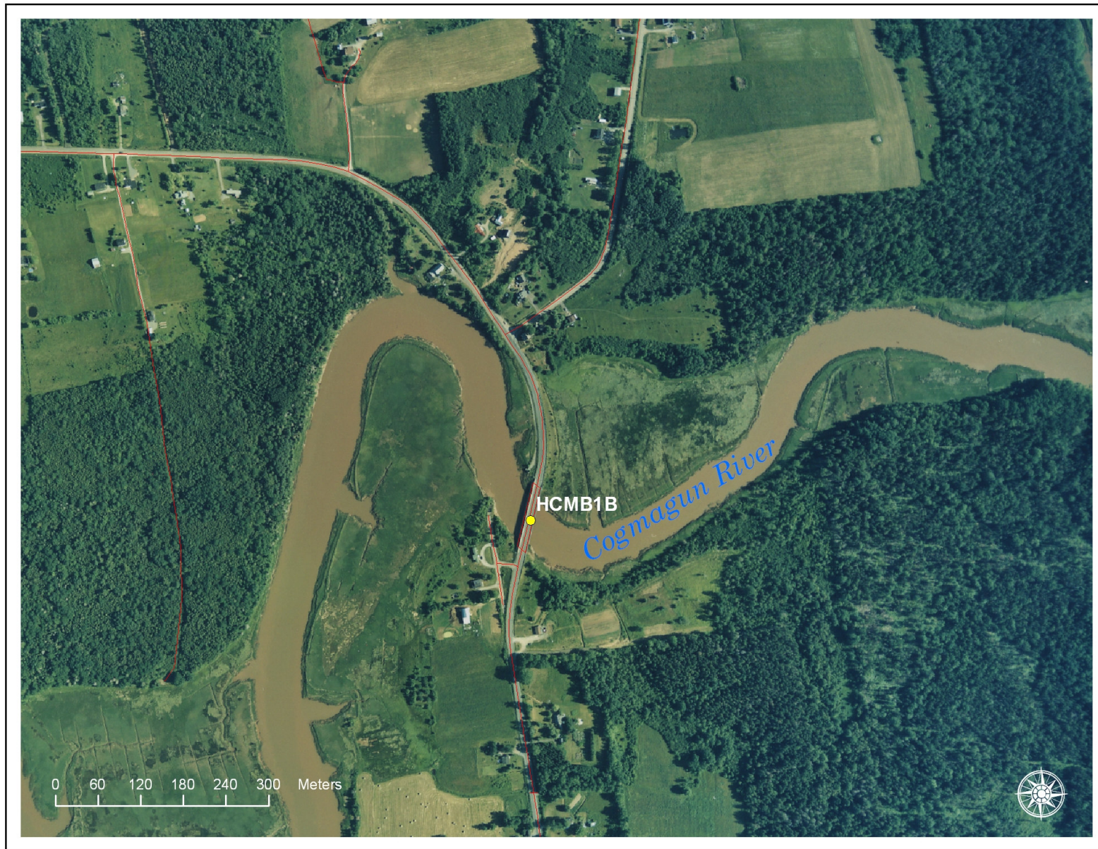
Figure 5: 2002 Aerial photograph containing tidal barrier data, (1: 10,000)