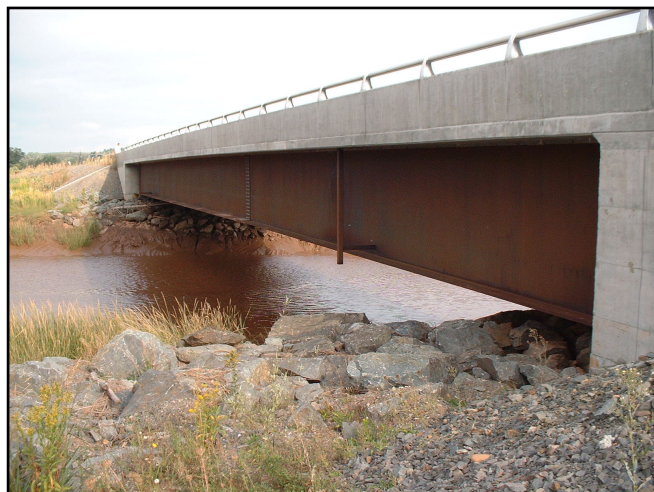
Figure 1: There are boulders on each side of the river for bank support, but generally appears to be above the high water line.