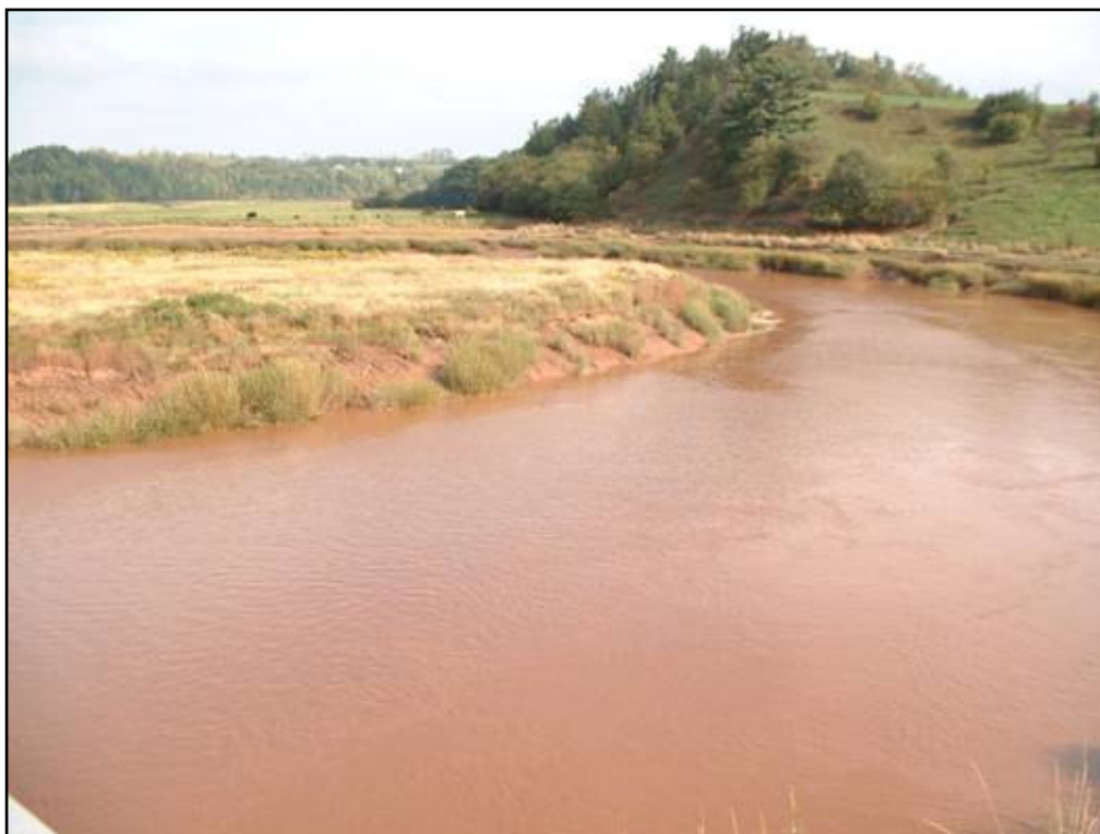
Figure 3: upstream