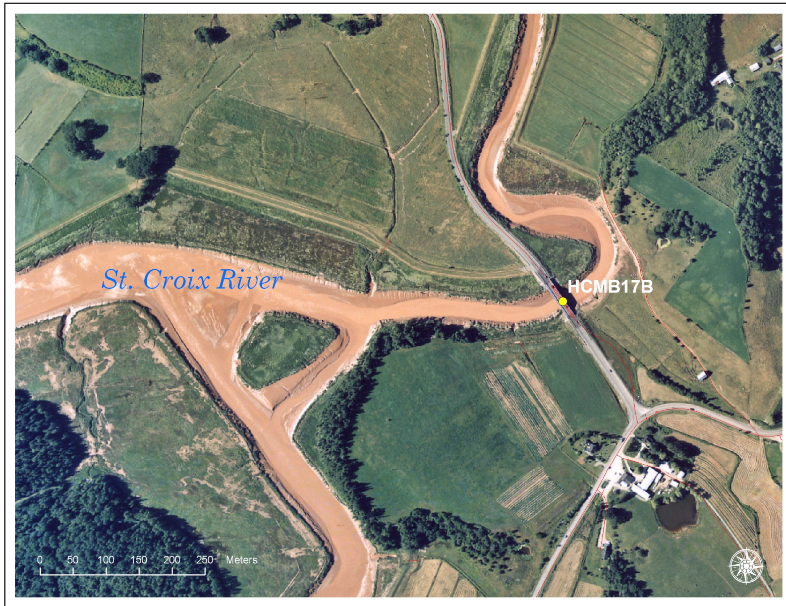
Figure 5: 2002 Aerial photograph containing tidal barrier data, (1: 10,000)