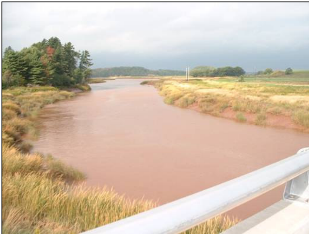
Figure 2: downstream