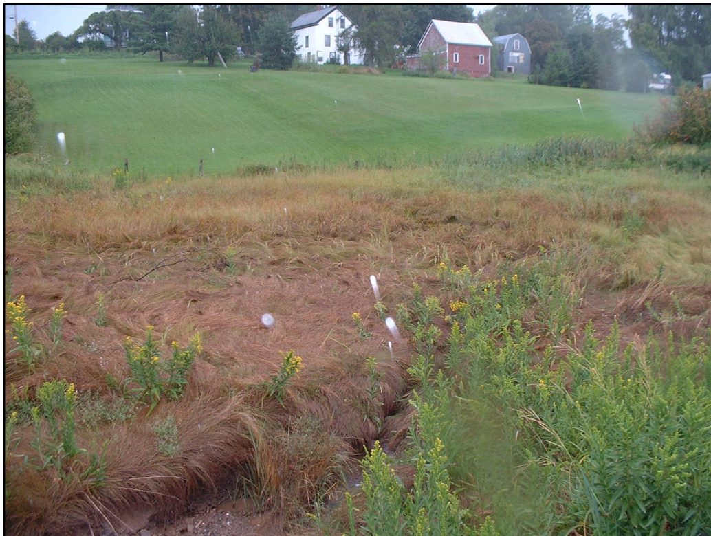
Figure 2: The farm upstream of the culvert and the obvious elevation rise.