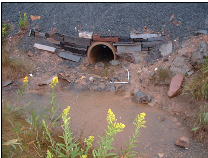
Figure 1: Downstream view of the culvert with the gravel build up and the pool.