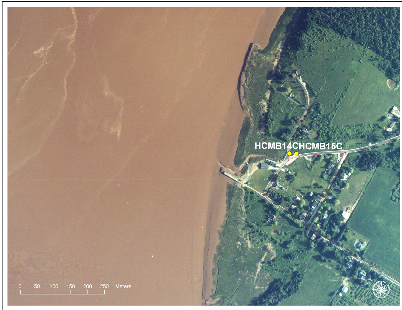
Figure 4: 2002 Aerial photograph containing tidal barrier data, (1: 10,000)