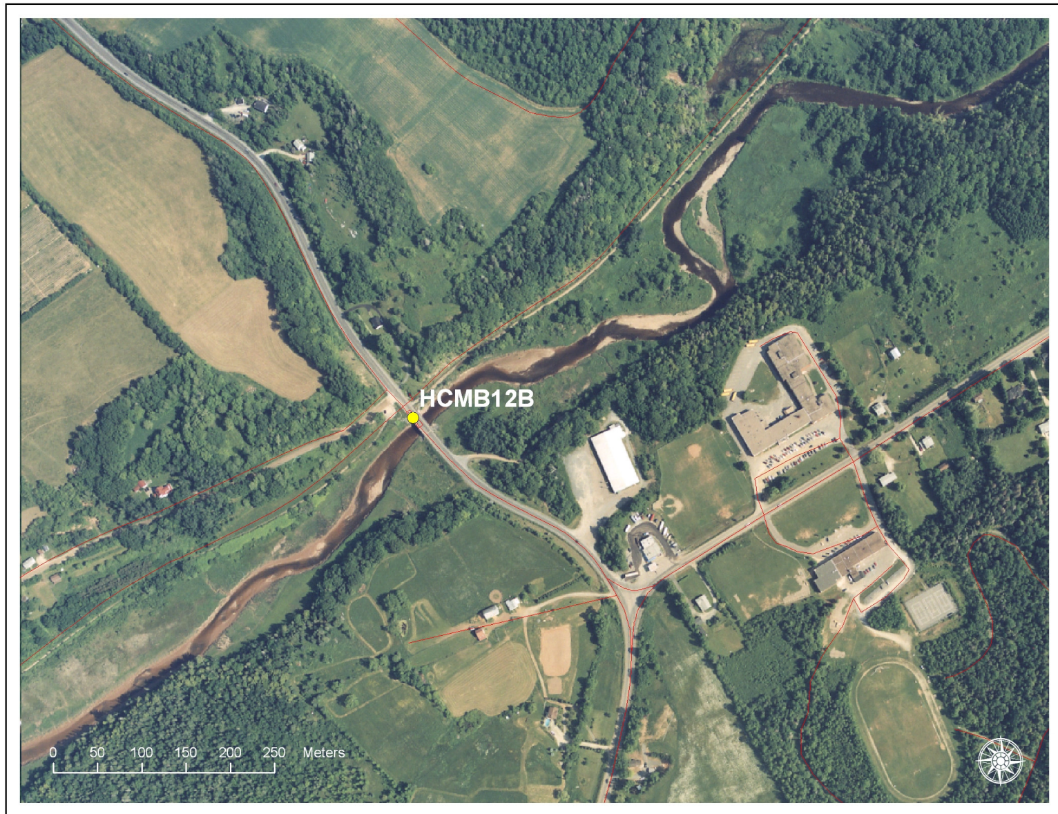
Figure 5: 2002 Aerial photograph containing tidal barrier data, (1: 10,000)