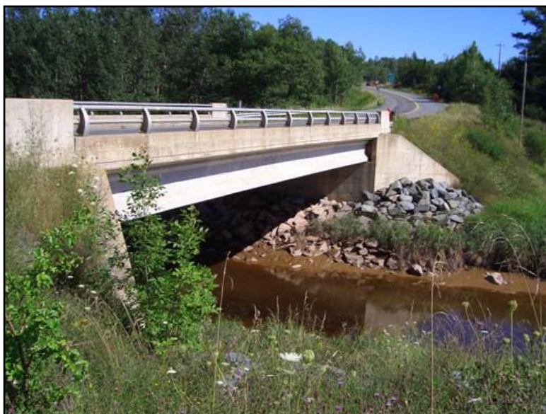
Figure 1: Upstream of bridge