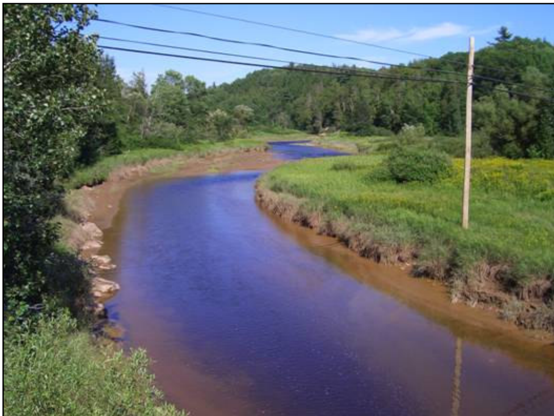
Figure 3: downstream of bridge