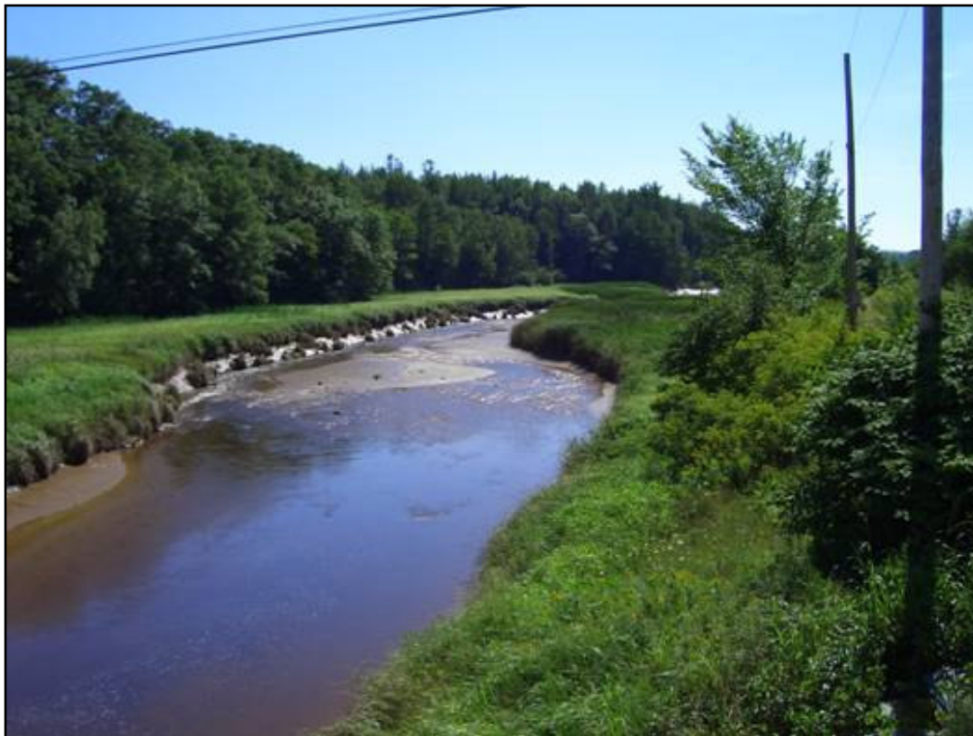
Figure 2: Upstream of bridge