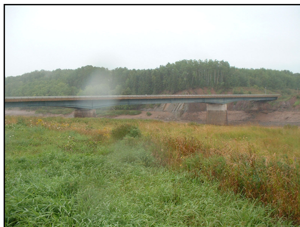
Figure 1: View of the bridge from downstream standing on the dyke. The cliffs on the south side visible.