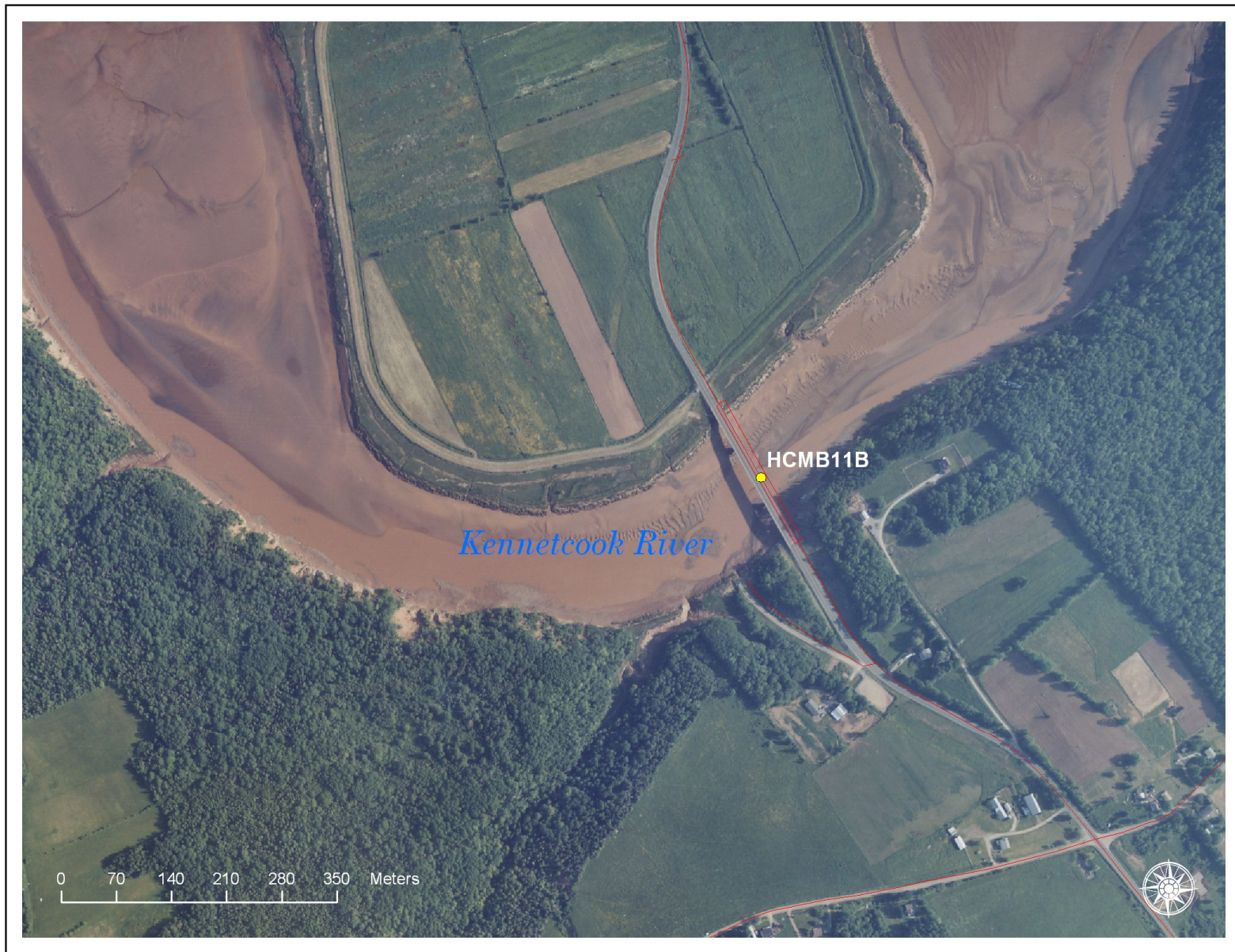
Figure 3: 2002 Aerial photograph containing tidal barrier data, (1: 10,000)