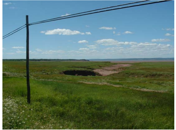
Figure 2. Downstream