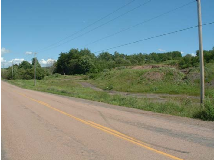
Figure 1. Upstream