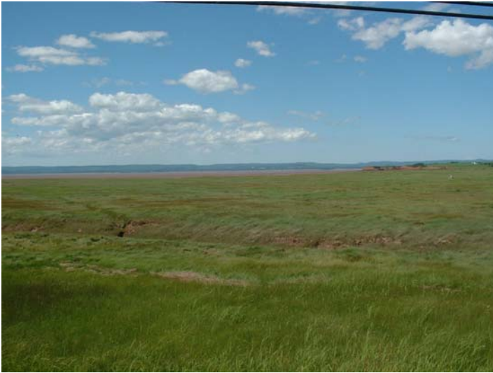
Figure 3. Downstream