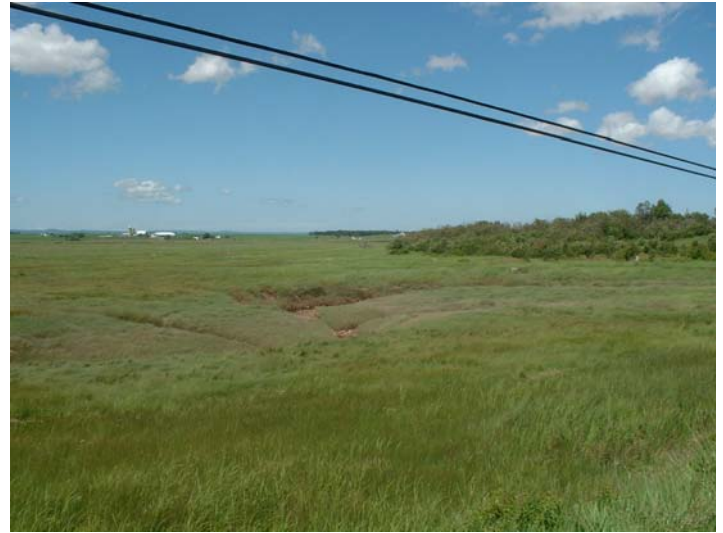
Figure 4. Downstream