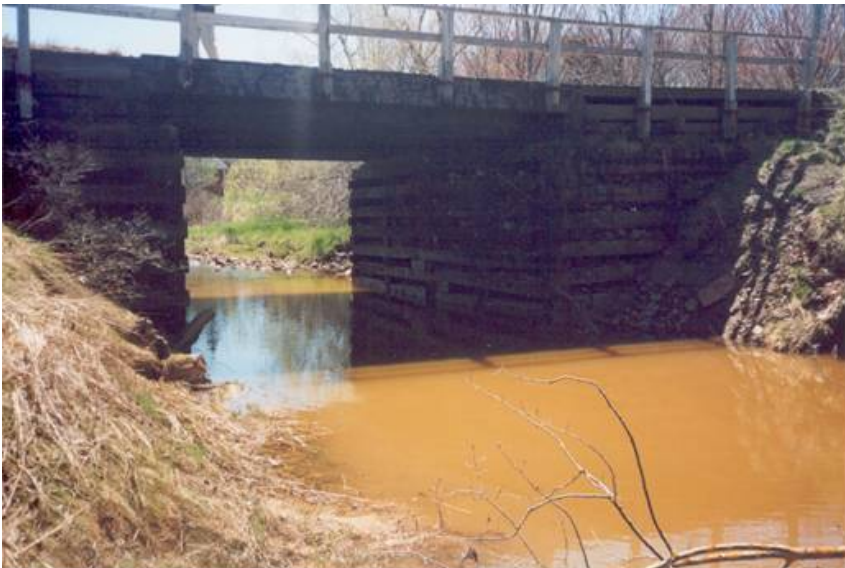
Figure 1. Downstream view of crossing