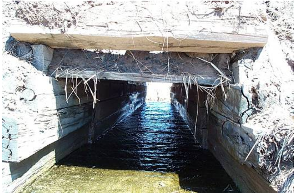
Figure 2. Downstream view of crossing