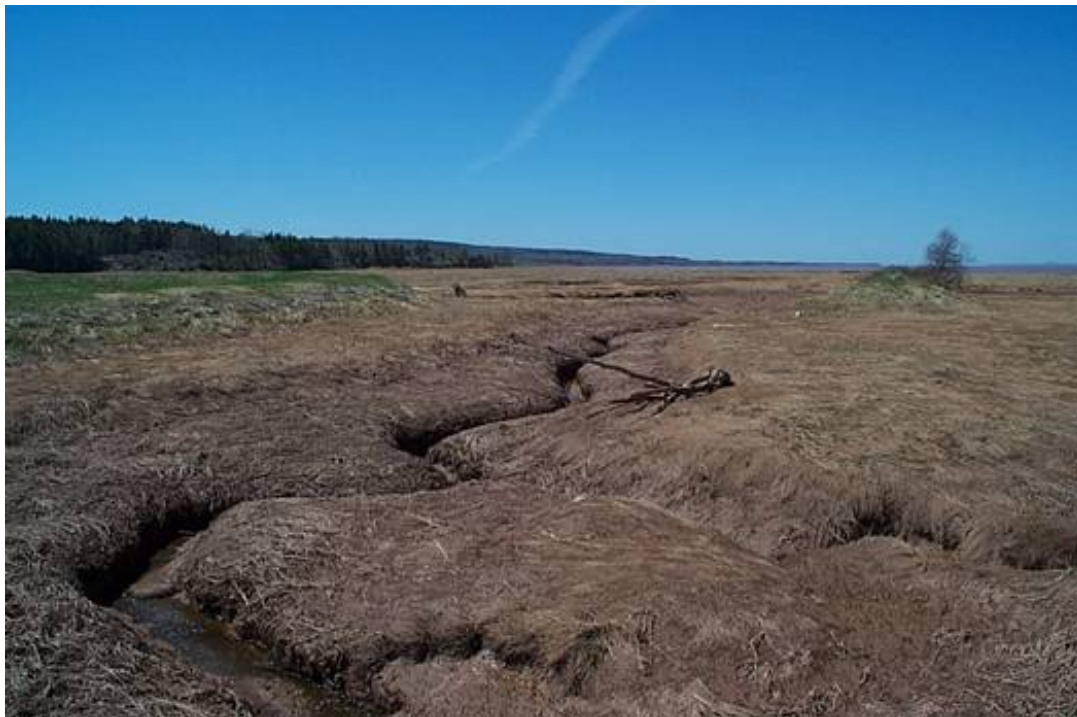
Figure 3. Downstream of crossing