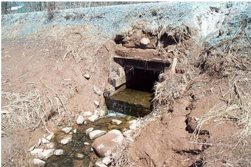
Figure 1. Downstream view of crossing