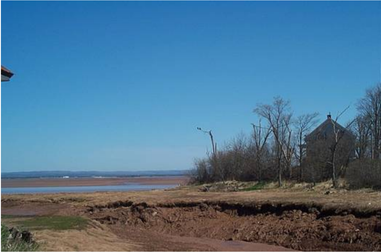
Figure 2. Downstream of crossing