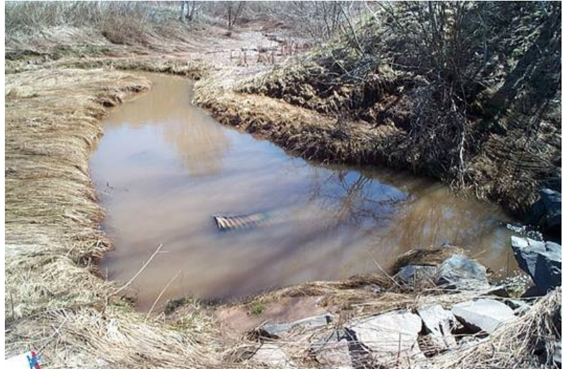
Figure 5. Downstream of crossing