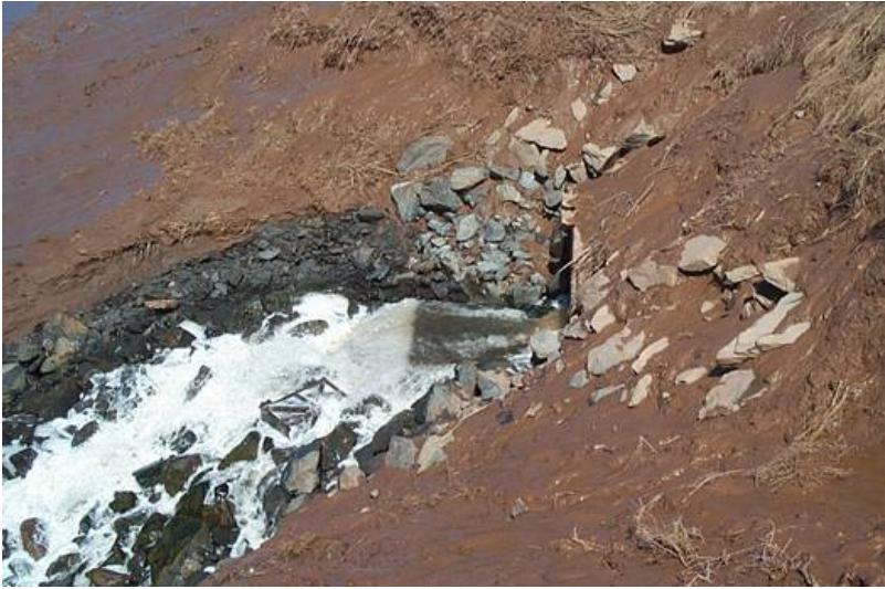
Figure 1. Downstream view of crossing