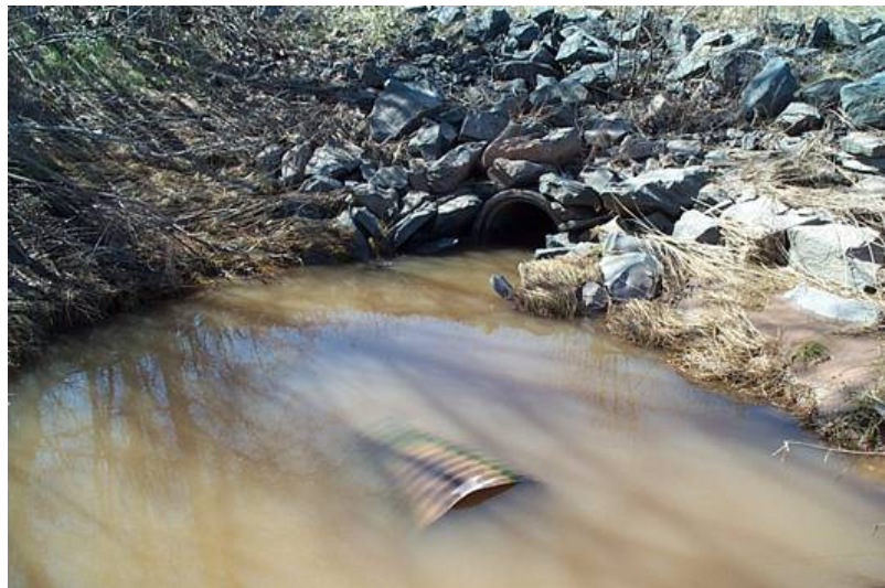
Figure 3. Downstream view of crossing