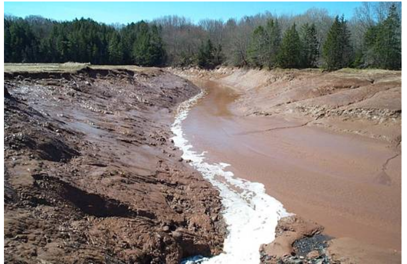
Figure 2. Downstream of crossing