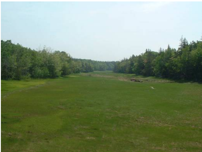
Figure 3. Upstream of crossing