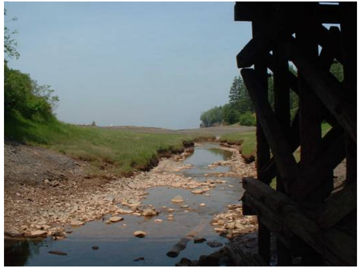
Figure 2. Downstream of crossing