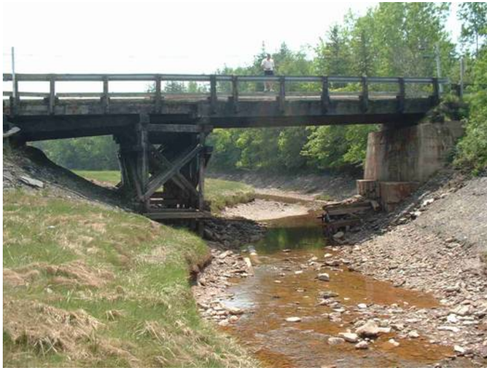
Figure 1. Downstream view of crossing