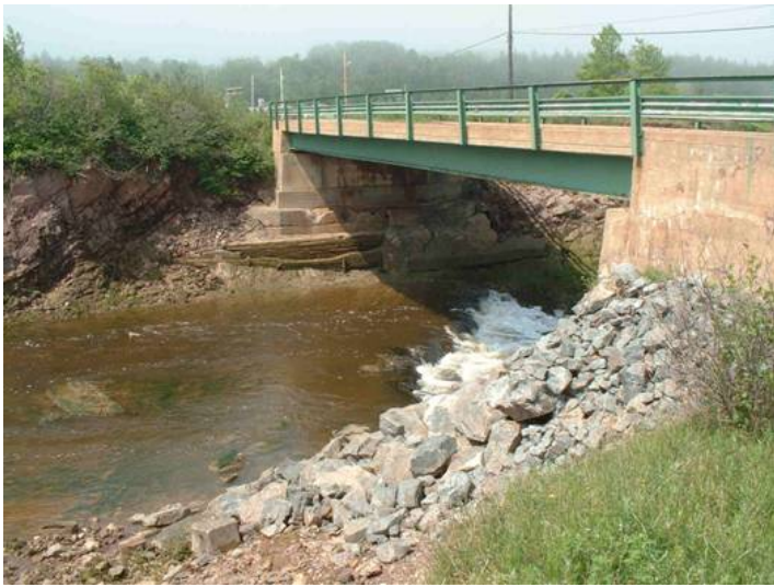
Figure 1. Upstream view of crossing