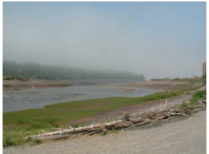
Figure 4. Upstream of crossing