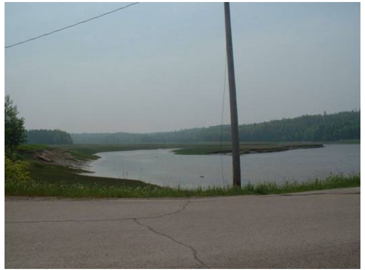
Figure 2. Upstream of crossing