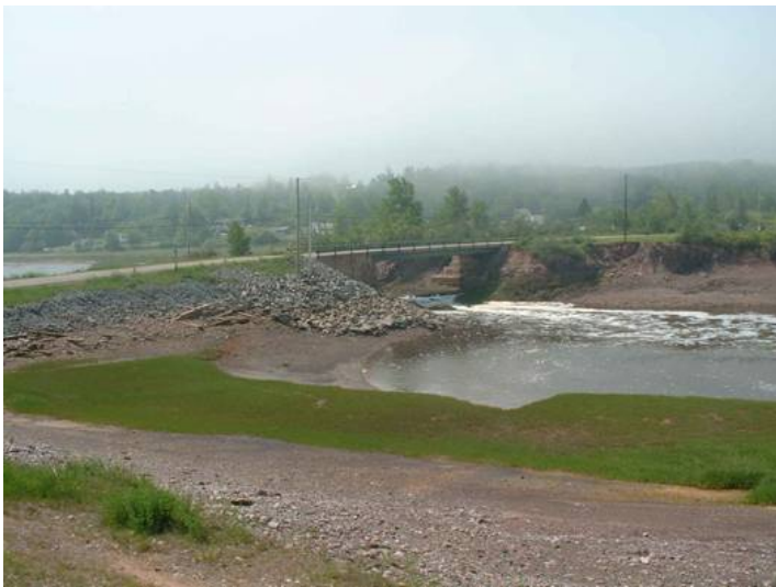
Figure 3. Downstream view of crossing