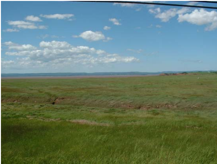
Figure 3. Downstream