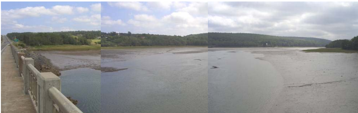
Figure 3. Upstream of crossing