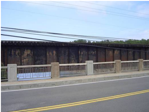
Figure 2. Downstream rail bridge taken from site DC10C