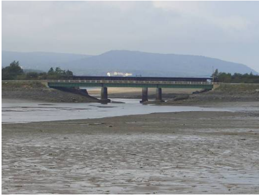
Figure 1. Upstream view of crossing