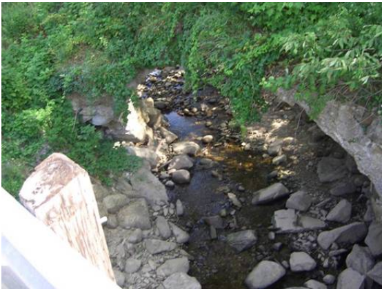
Figure 2. Upstream of crossing