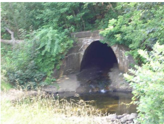
Figure 3. Upstream open bottom concrete culvert in an old road crossing which does not appear to be restricting.