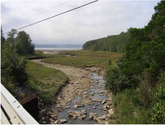
Figure 1. Downstream of crossing