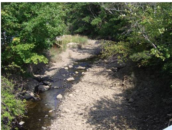
Figure 1. Upstream of crossing