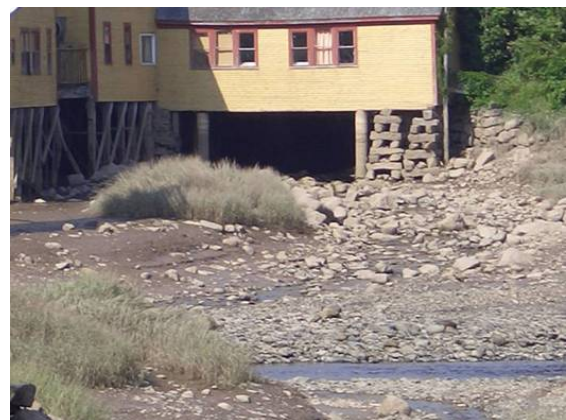
Figure 2. Downstream view of crossing.