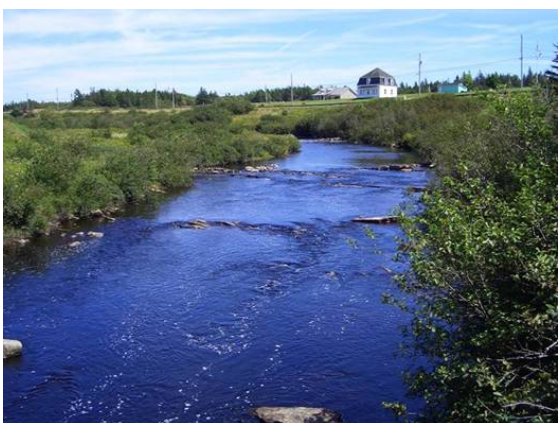
Figure 3. Upstream of crossing