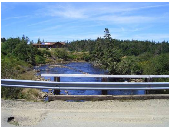
Figure 2. Downstream of crossing showing bank erosion and collapse of trees into river