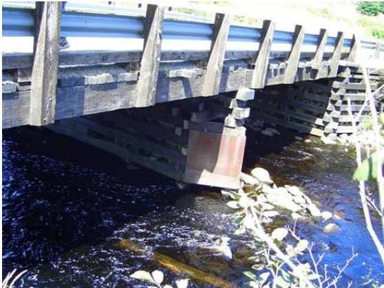
Figure 1. Downstream view of crossing