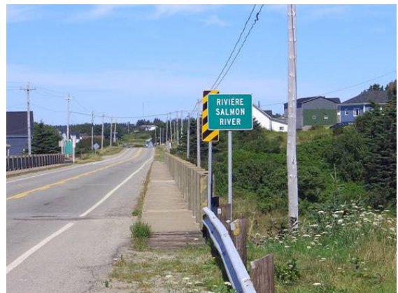
Figure 4. View of bridge from road.