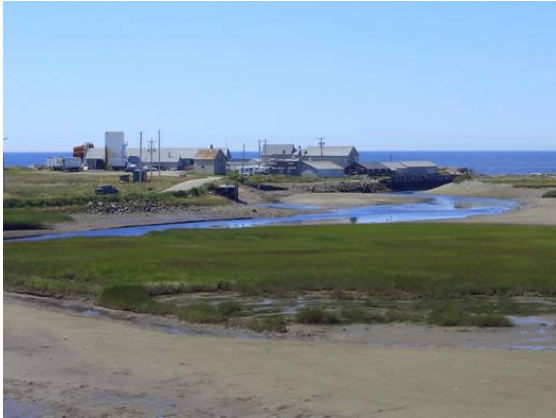
Figure 1. Downstream of bridge, old wharf and buildings at mouth of river