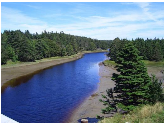
Figure 3. Upstream of crossing