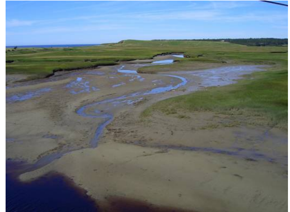
Figure 2. Downstream of bridge, north side of river showing tributary and salt marsh system