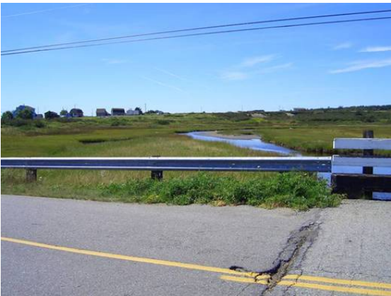
Figure 3. Upstream of crossing