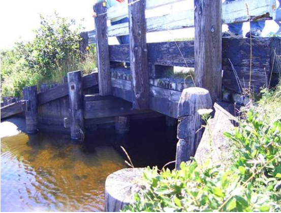
Figure 1. Downstream view of crossing