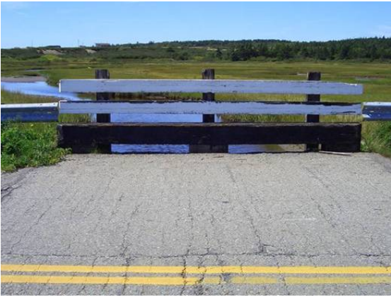
Figure 2. Downstream of crossing