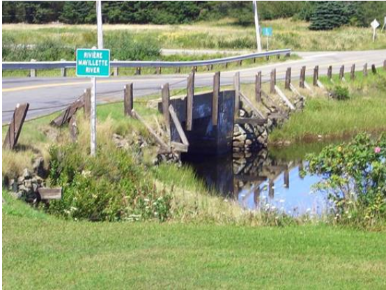
Figure 1. Upstream view of crossing