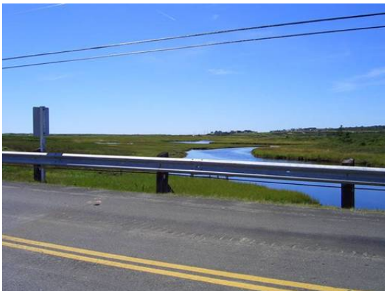
Figure 3. Downstream of crossing, large marsh system leading to DC44B and DC45B