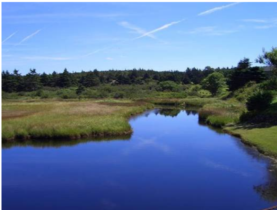
Figure 2. Upstream of crossing showing large scour pool