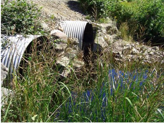
Figure 1. Downstream view of crossing showing erosion of rocks from bank around culverts