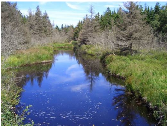
Figure 3. Upstream of crossing bordered by forest.