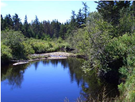
Figure 2. Downstream of crossing bordered by forest.