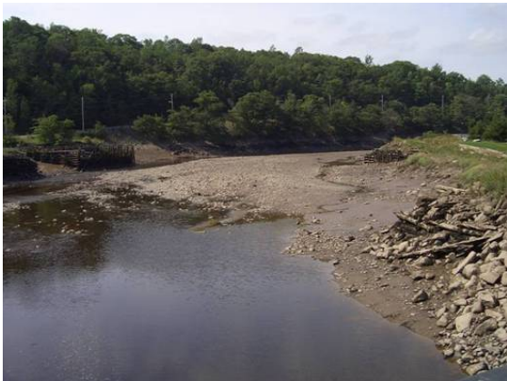
Figure 2. Downstream of crossing