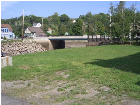
Figure 1. Downstream view of crossing