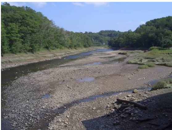
Figure 3. Upstream of crossing