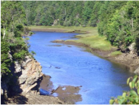
Figure 2. Downstream of crossing