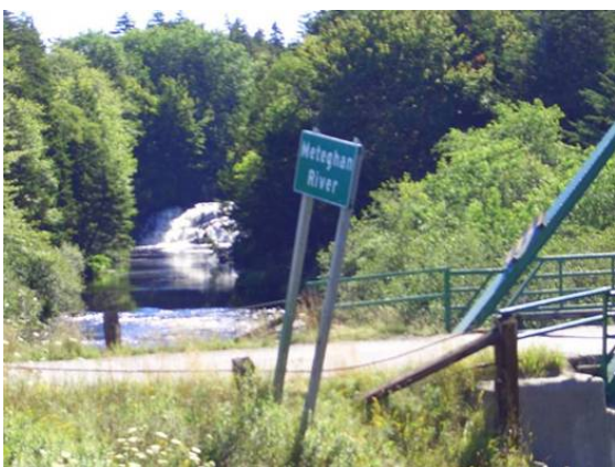
Figure 3. Upstream of crossing showing waterfall