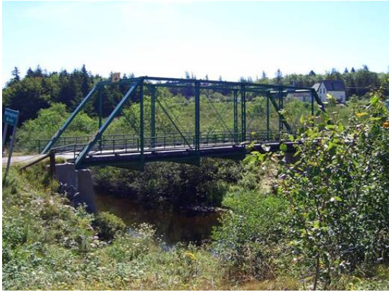
Figure 1. Downstream view of crossing