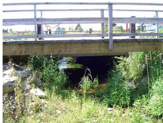
Figure 2. Upstream view of crossing showing foot bridge