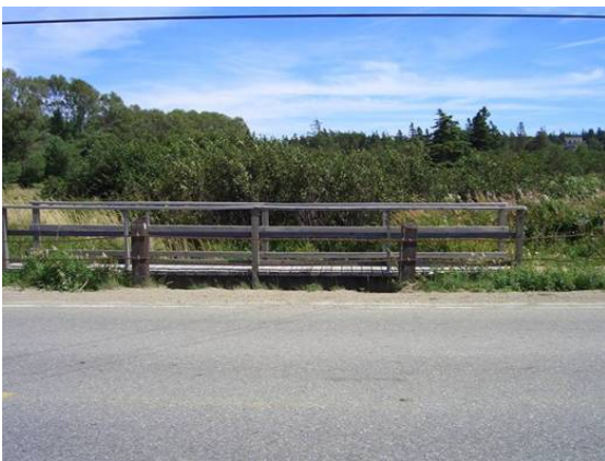
Figure 1. Upstream of crossing